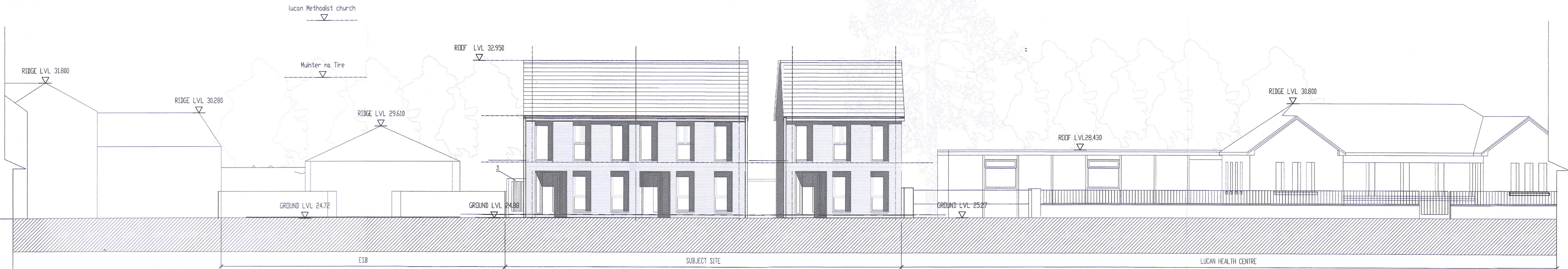
CONTIGUOUS ELEVATION SCALE 1:100