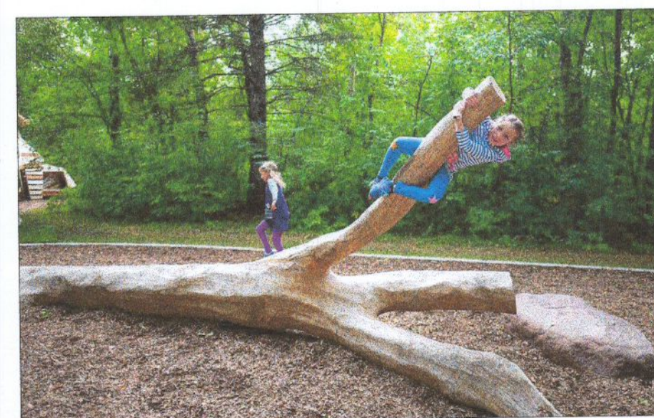
1 - 4m long seasoned hardwood logs with all branches removed