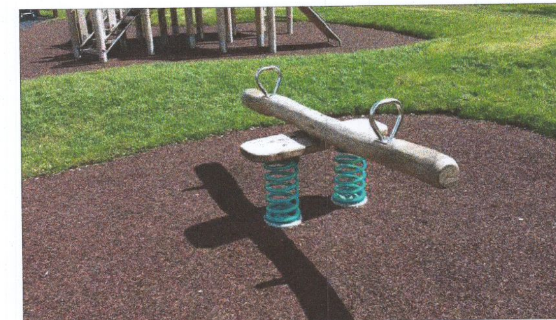
Tiger mulch to base of outdoor gym and formal playground equipment

Note 1: All play equipment to conform to EN 1176-1-11 and 1177 Playground Equipment and surfacing