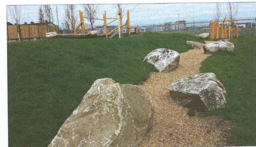
2 Large boulders to be placed flat-side up to enable play