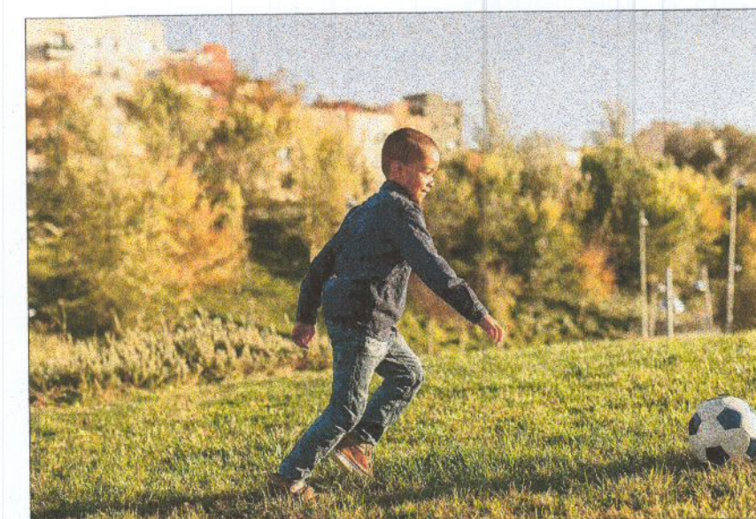
4 Informal kickabout space