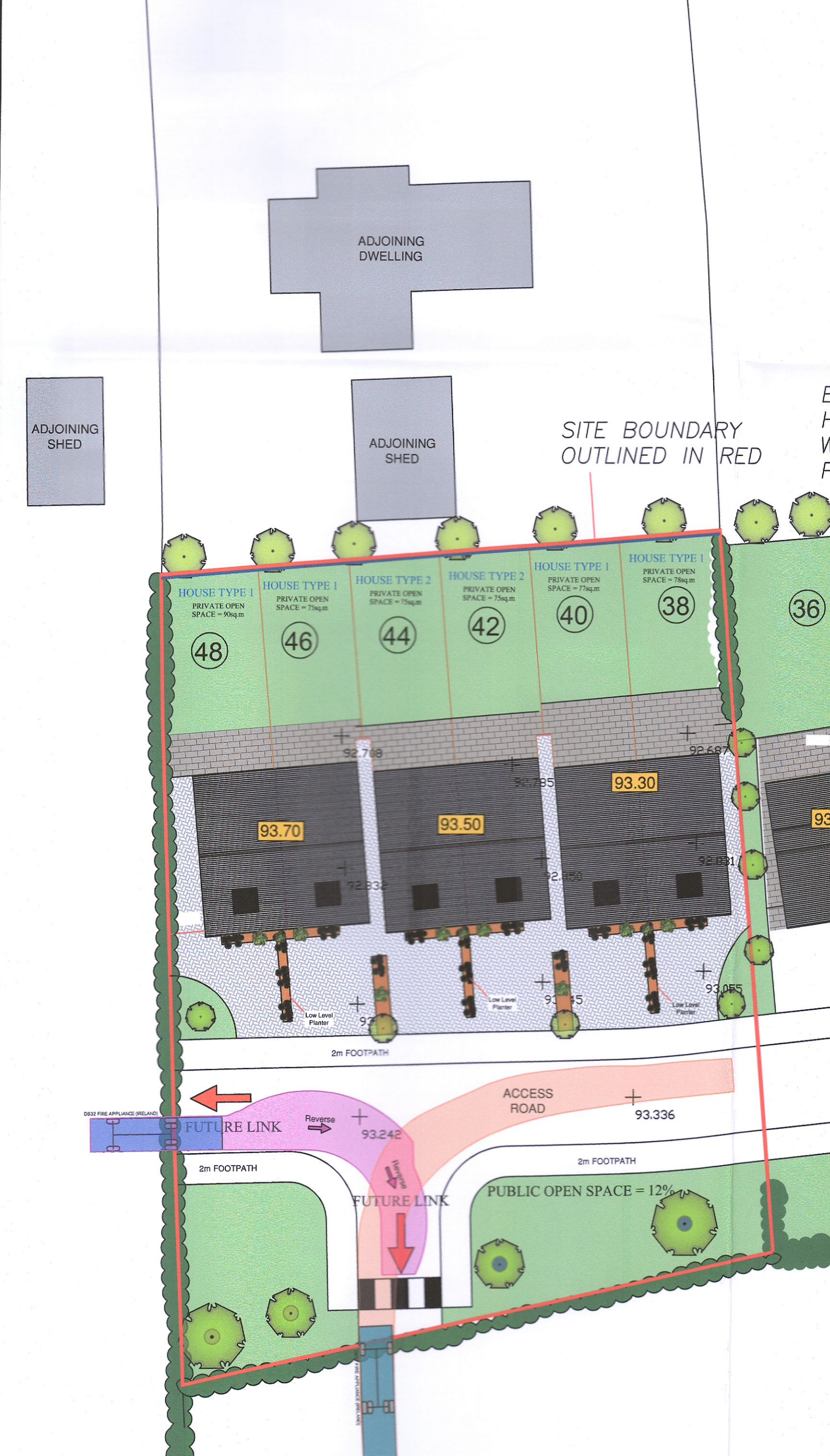
Auto Tracking Vehicle Details - Fire Engine