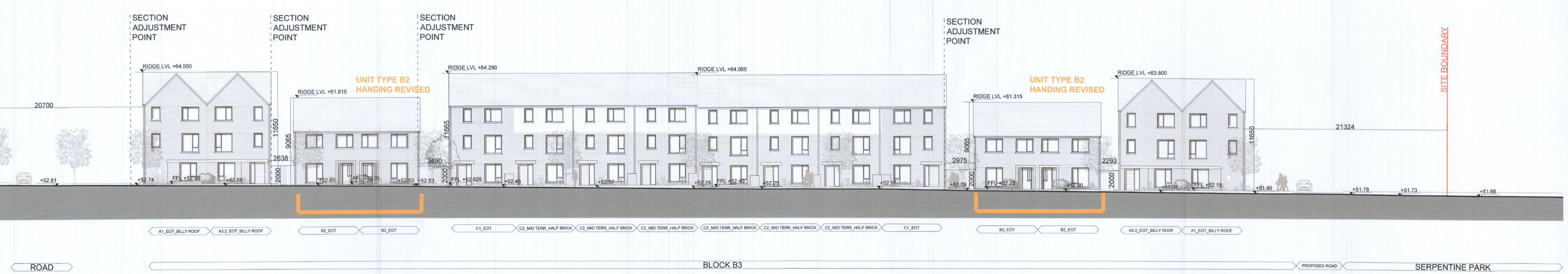
3 PROPOSED CONTIGUOUS ELEVATION E-E Part B 1:200 0209