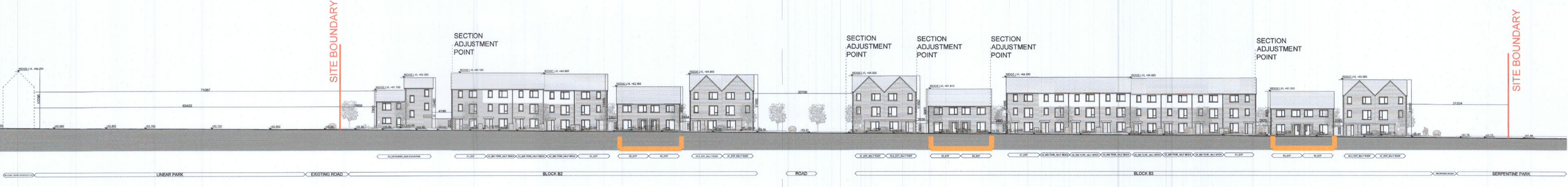
1 PROPOSED CONTIGUOUS ELEVATION E-E Part A 1:200 0209