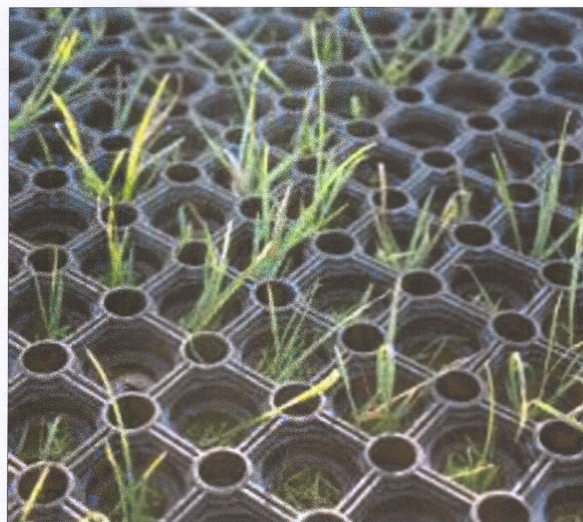
D 04 Rubber grass mat safety surface or similar and approved

supplier: https://www.nhbs.com/title?slug=2f-schwegler-bat-box-general-purpose