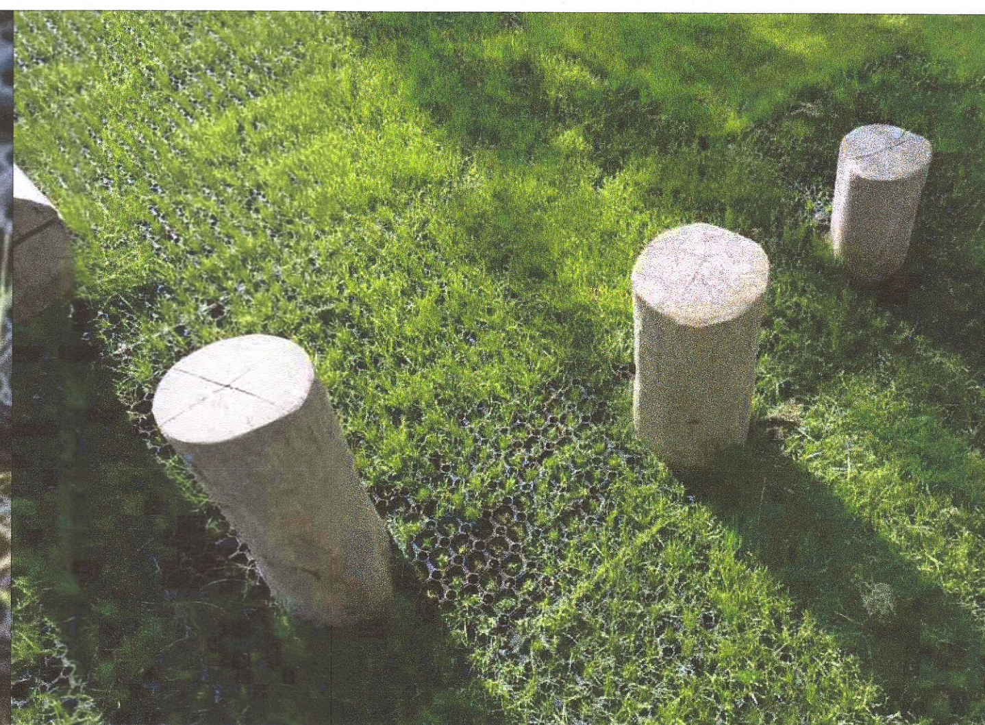
D 05 Informal play equipment or similar and approved

supplier: http://creativeplay.ie/our-products/grass-mats/