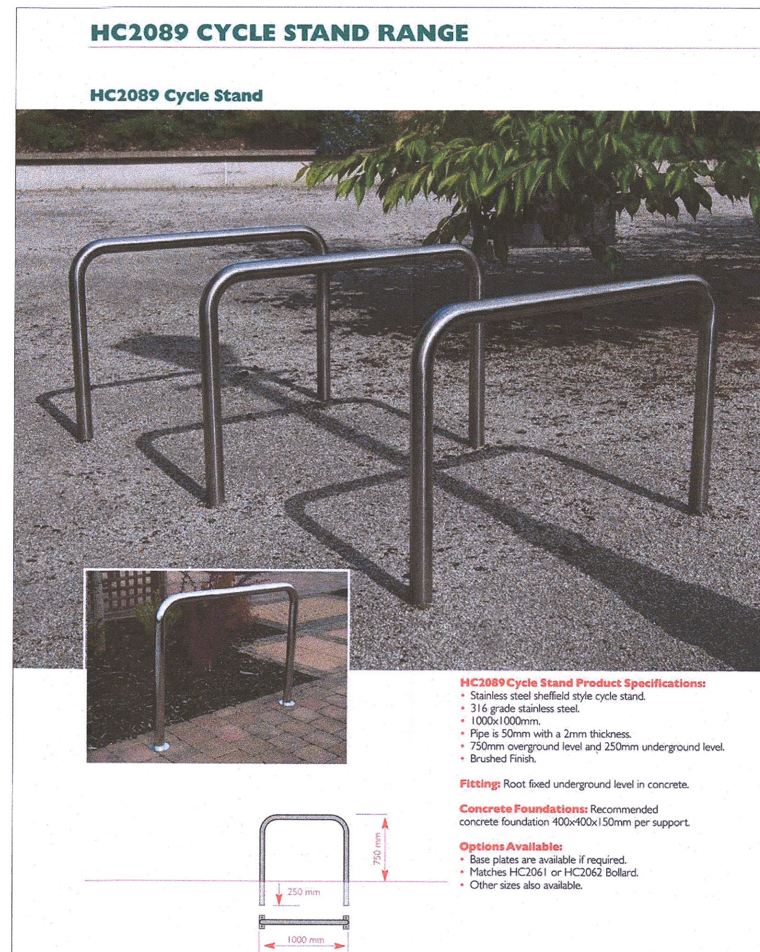
D 02 Stainless steel Sheffield cycle stand or similar and approved

Supplier: https://www.hartecast.com/all-products/cycle-stands/hc2089-sheffield-cycle-stand/