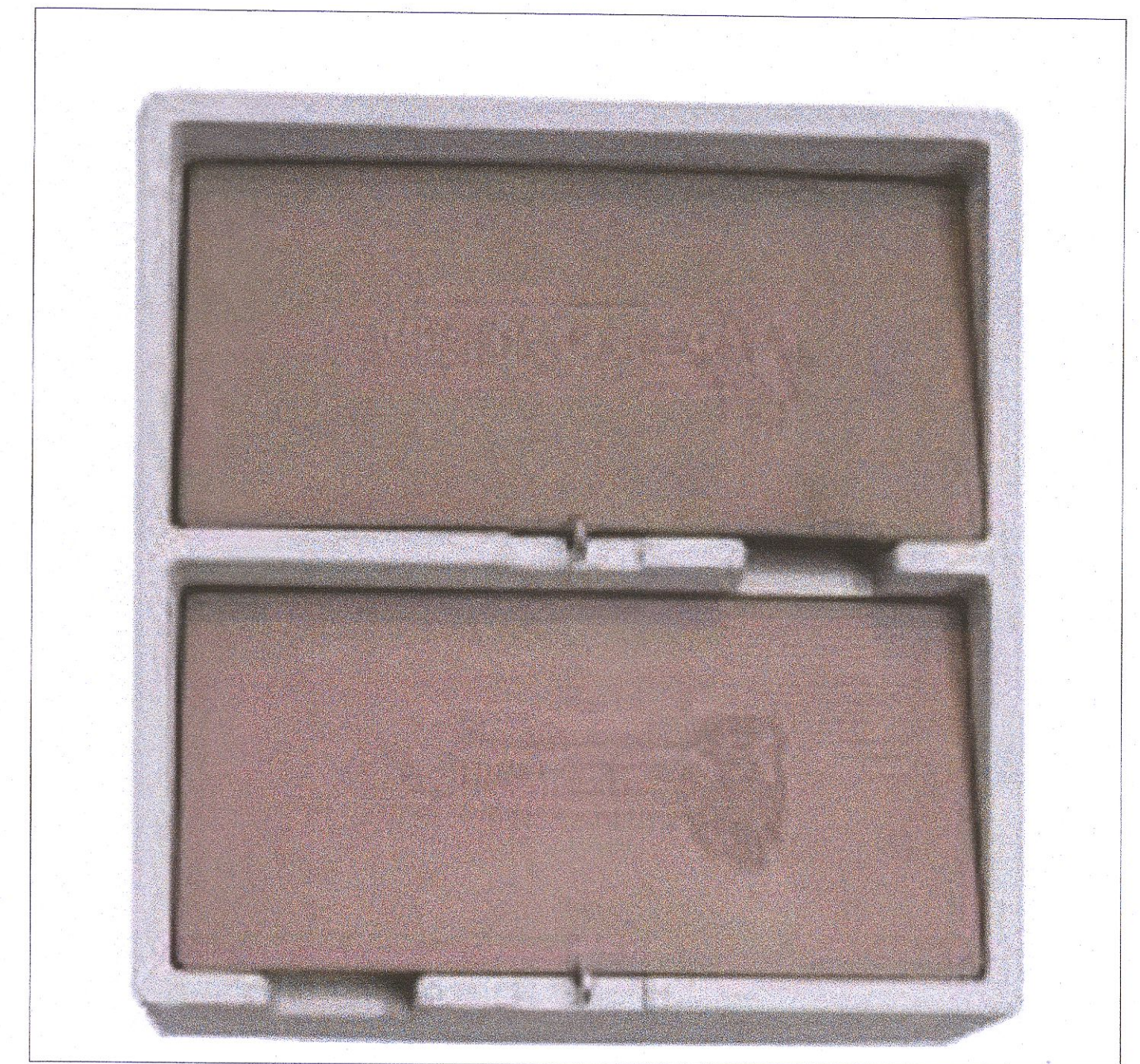
D 03 Schwegler Bat Box or similar and approved

Supplier: https://www.hartecast.com/all-products/cycle-stands/hc2089-sheffield-cycle-stand/