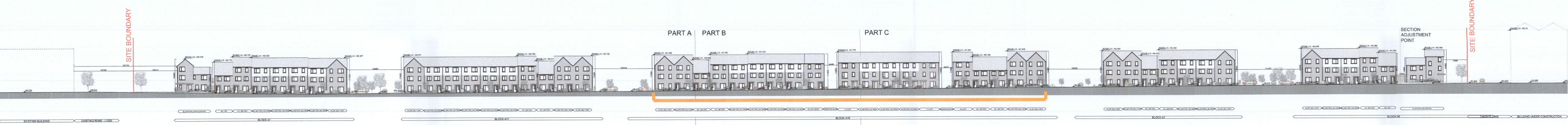
1 Proposed Contiguous Elevation A-A 1:500