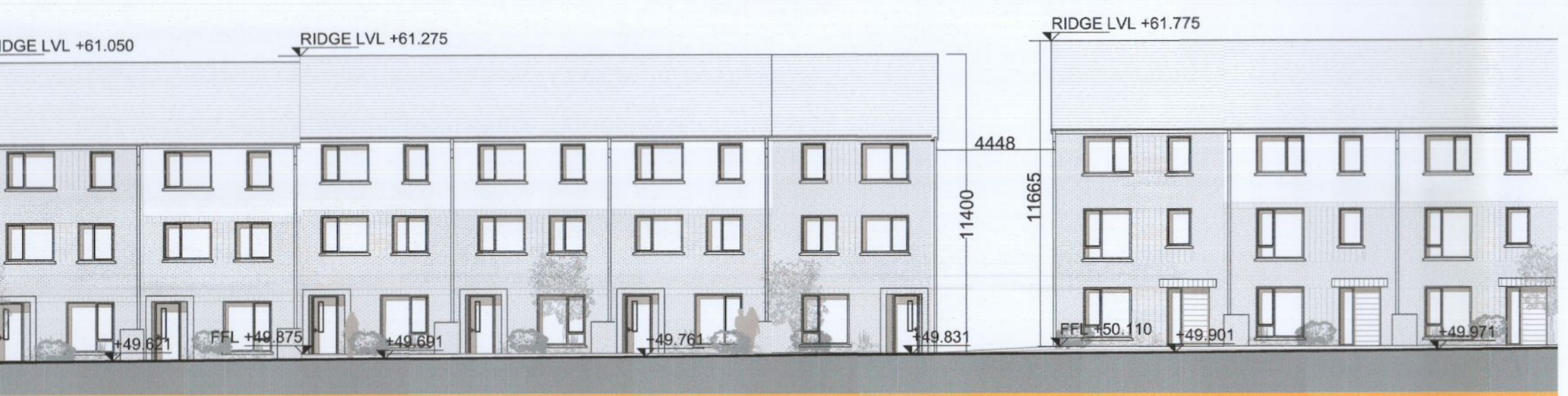
RFI 3A: BLOCK A 10 REVISED TO ACCOMMODATE EAST-WEST LINK