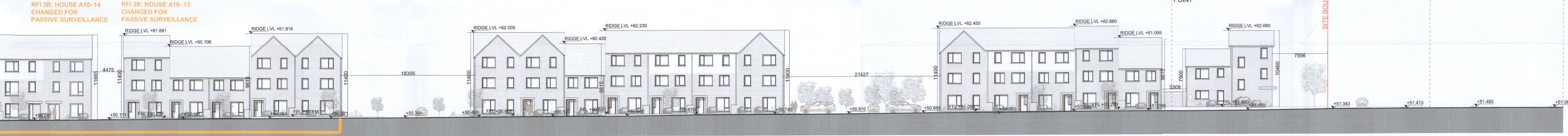
RFI 3A: BLOCK A 10 REVISED TO ACCOMMODATE EAST-WEST LINK