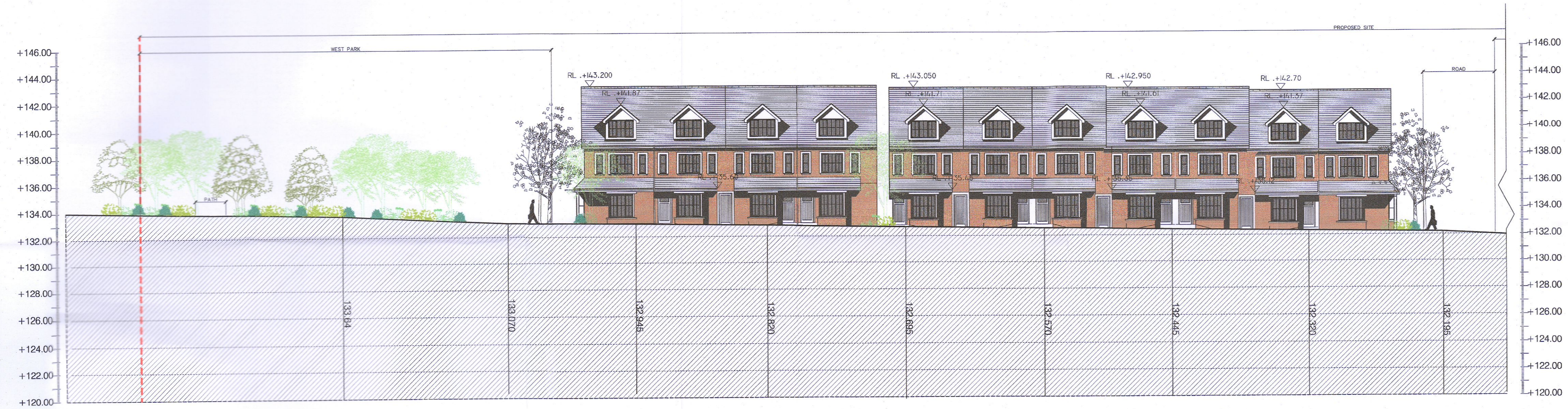
PROPOSED CONTEXTUAL 4 - NORTH (PART 1 OF 2) SCALE 1:200