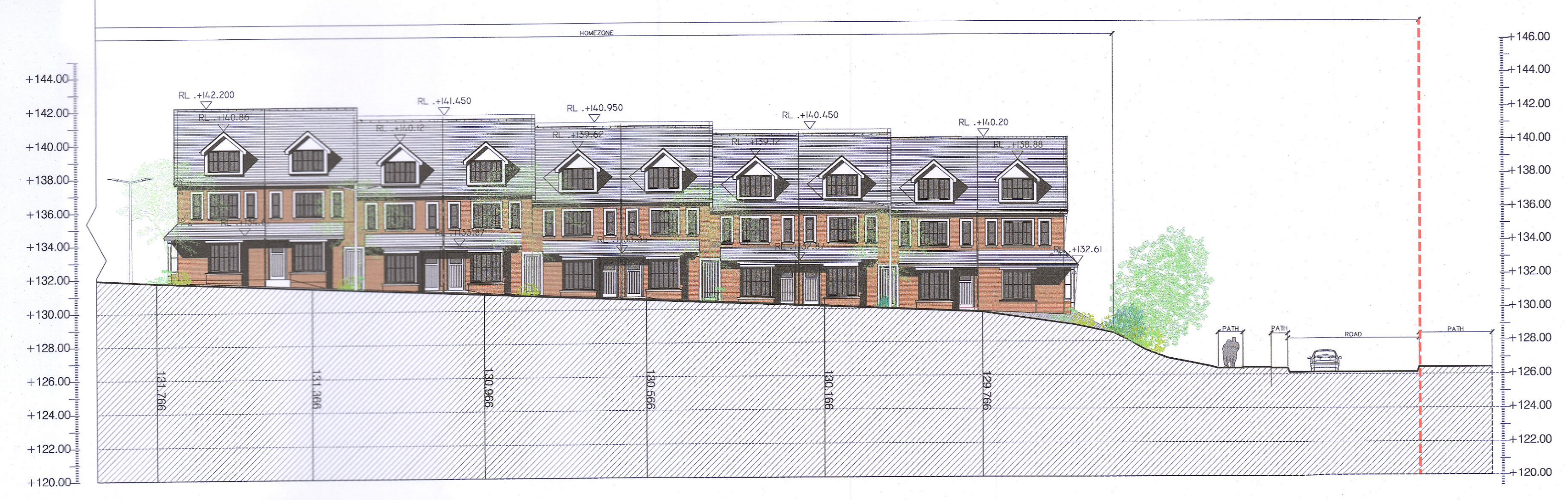
PROPOSED CONTEXTUAL 4 - NORTH (PART 2 OF 2) SCALE 1:200