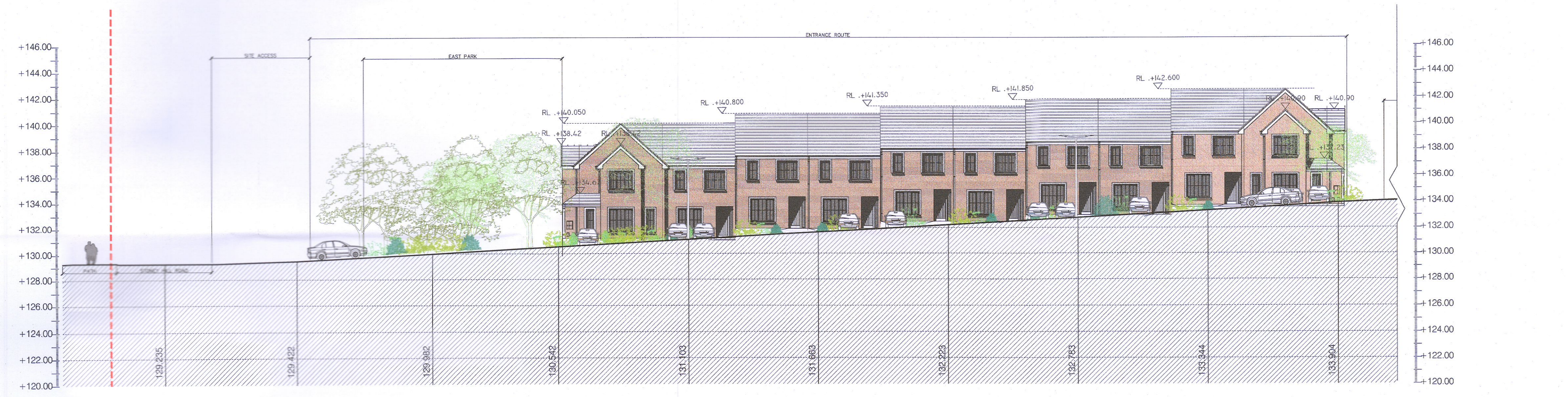
PROPOSED CONTEXTUAL 2 - SOUTH (PART 1 OF 2) SCALE 1:200