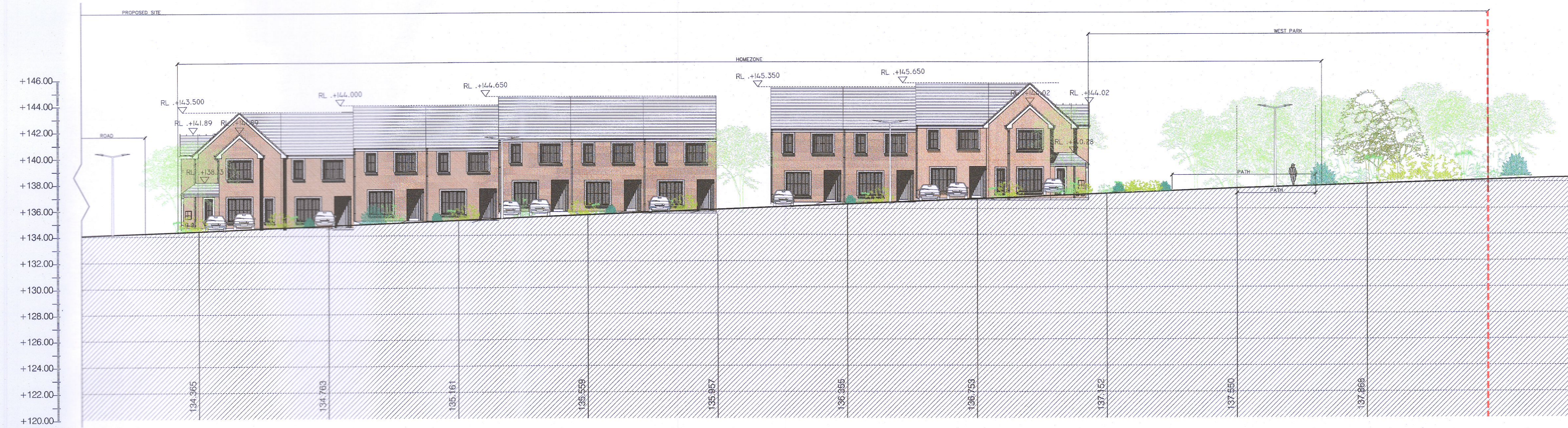
PROPOSED CONTEXTUAL 2 - SOUTH (PART 2 OF 2) SCALE 1:200