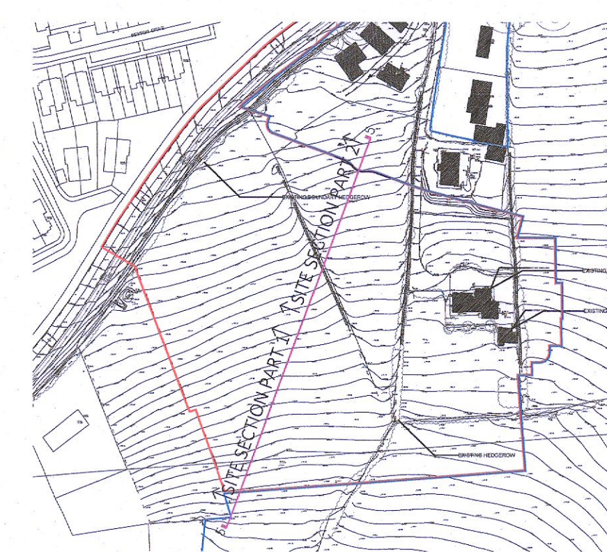
KEY PLAN - EXISTING CONTEXTUALS SCALE 1:2500