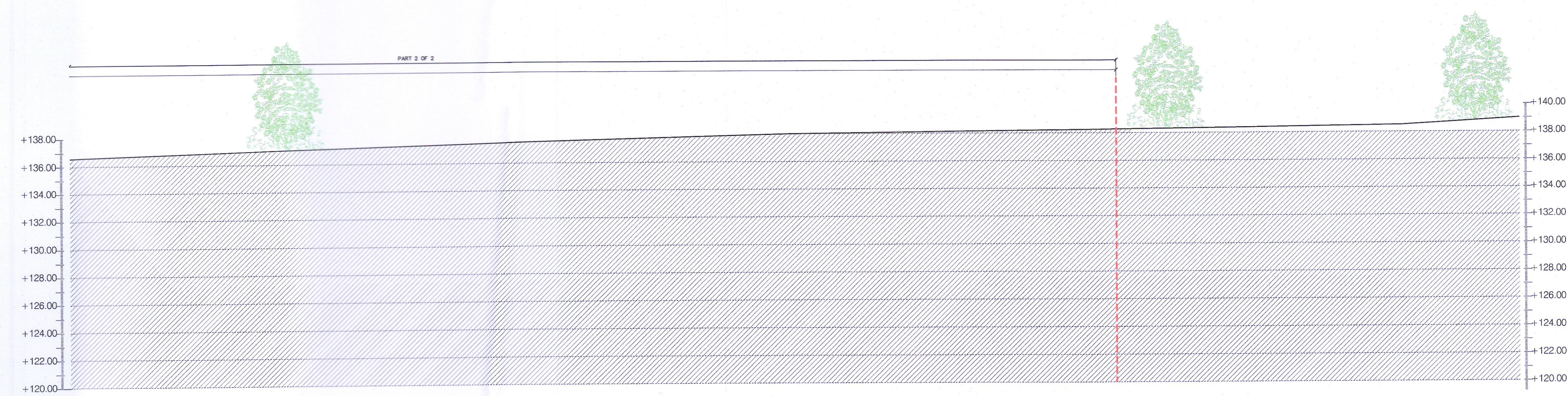
EXISTING CONTEXTUAL 2 - SOUTH (PART 2 OF 2) SCALE 1:200