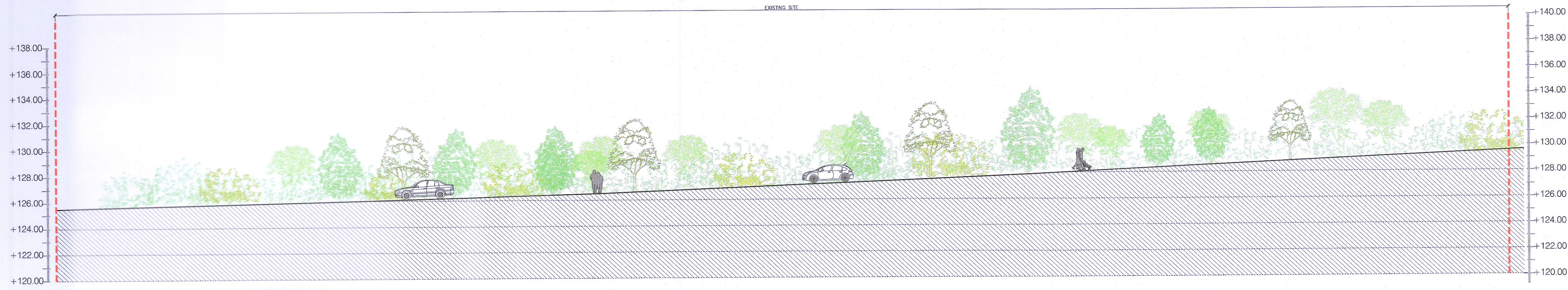
EXISTING CONTEXTUAL 1 - WEST SCALE 1:200

1. All boundaries, dimensions and levels are to be checked on site before construction and any discrepancies are to be reported to the Architect. 2. Partial Service: Any discrepancies with site or other information is to be advised to the Architect and direction or approval is to be sought before the implementation of the detail. 3. Block and site plans are reproduced under license from the Ordnance Survey. 4. Do not scale this drawing. 5. For the purpose of coordination, all relevant parties must check this information prior to implementation and report any discrepancies to the Architect.