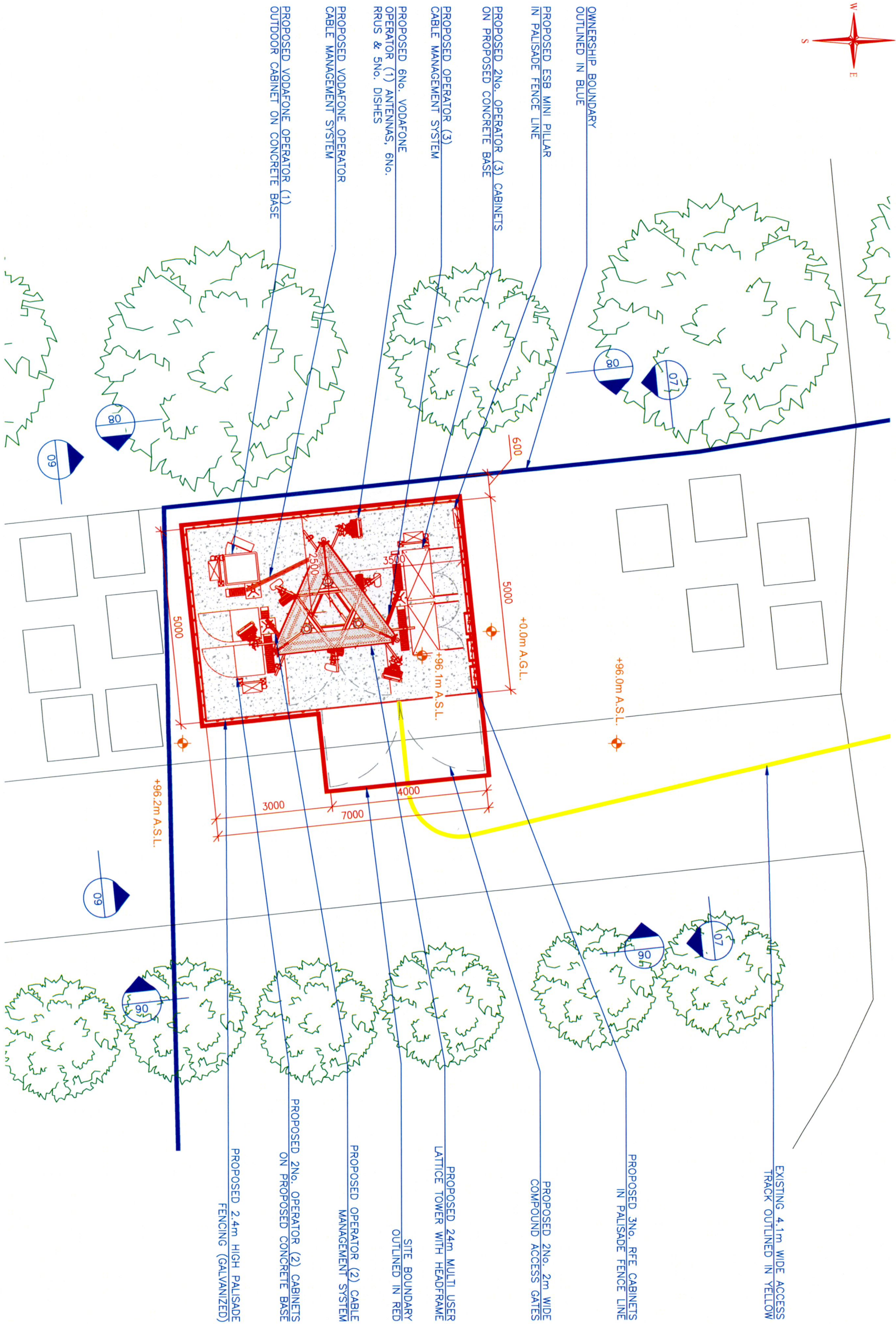
SITE LAYOUT PLAN SCALE 1:100