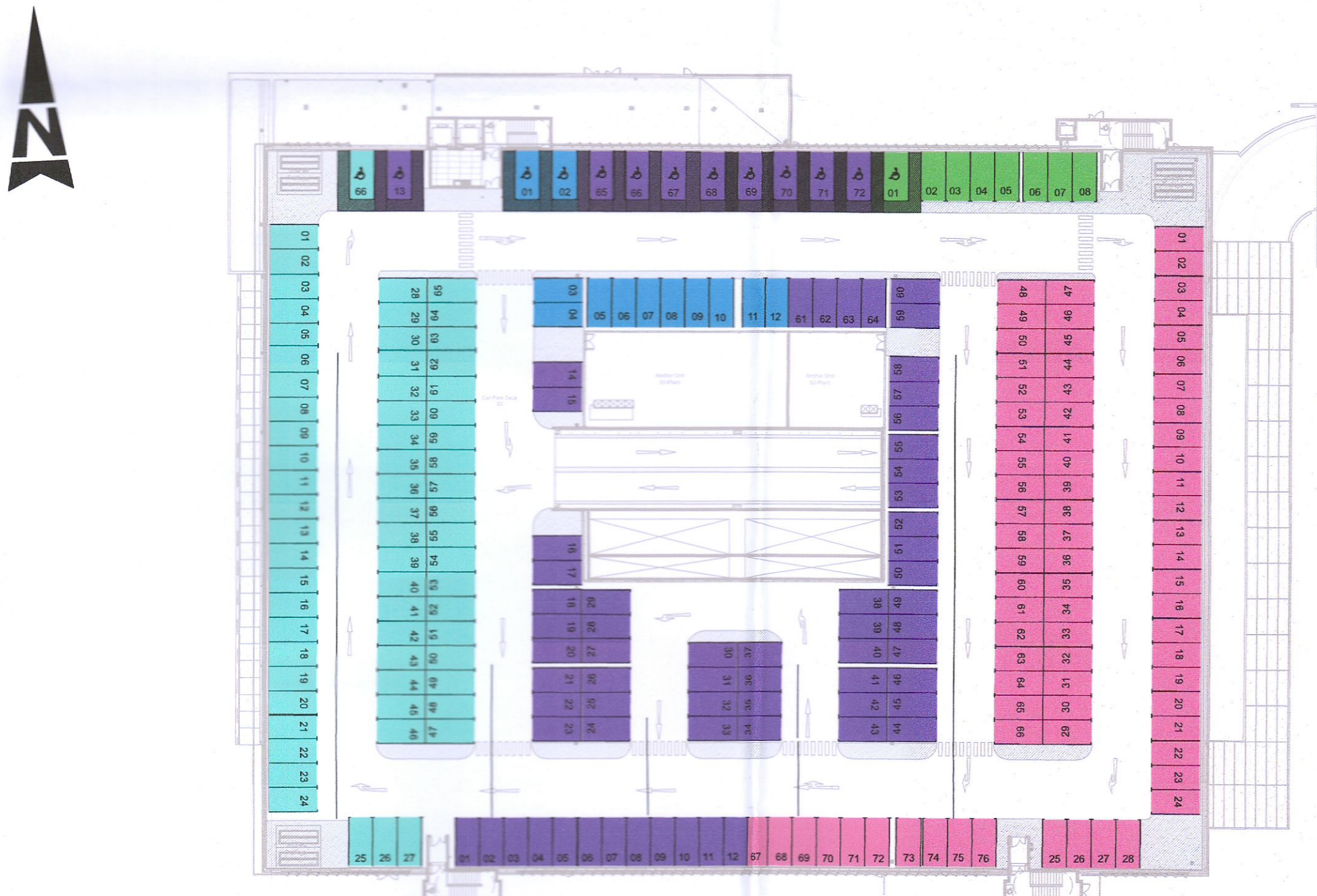
PARKING LEVEL 3 ■ 72 SPACES - PARKING ASSIGNED TO BLOCK ACD ■ 66 SPACES - PARKING ASSIGNED TO BLOCK B&E ■ 76 SPACES - PARKING ASSIGNED TO BLOCK G SPACES ■ 12 SPACES - PARKING ASSIGNED TO BLOCK H 12 SPACES ■ 8 SPACES - NON-RESIDENTIAL PARKING SPACES