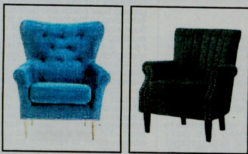
Collection and Delivery Arranged

Recovering your Furniture to its Former Glory!