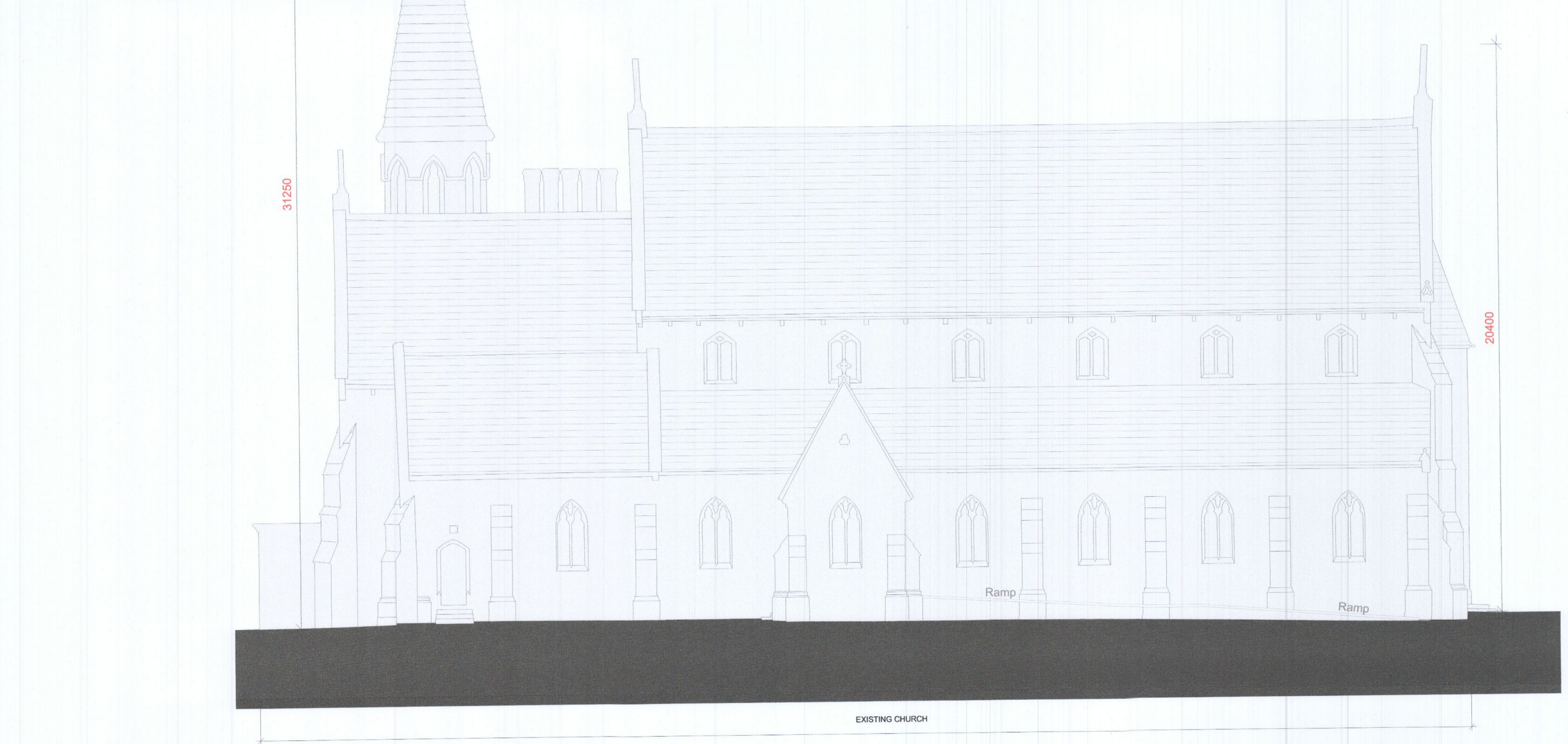
Elevation-02 Scale 1:100