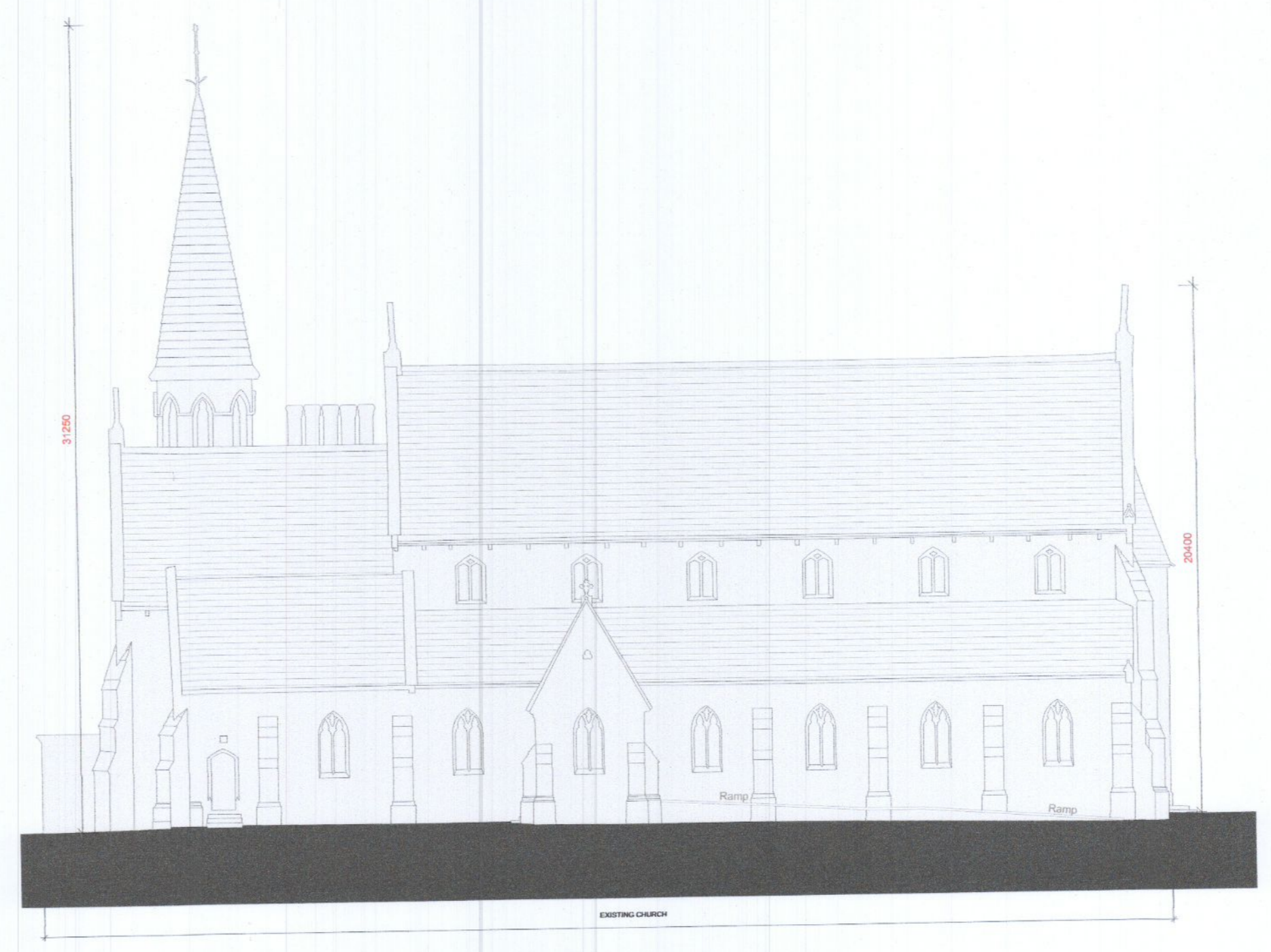
Elevation-02 - North Elevation - Scale 1:200