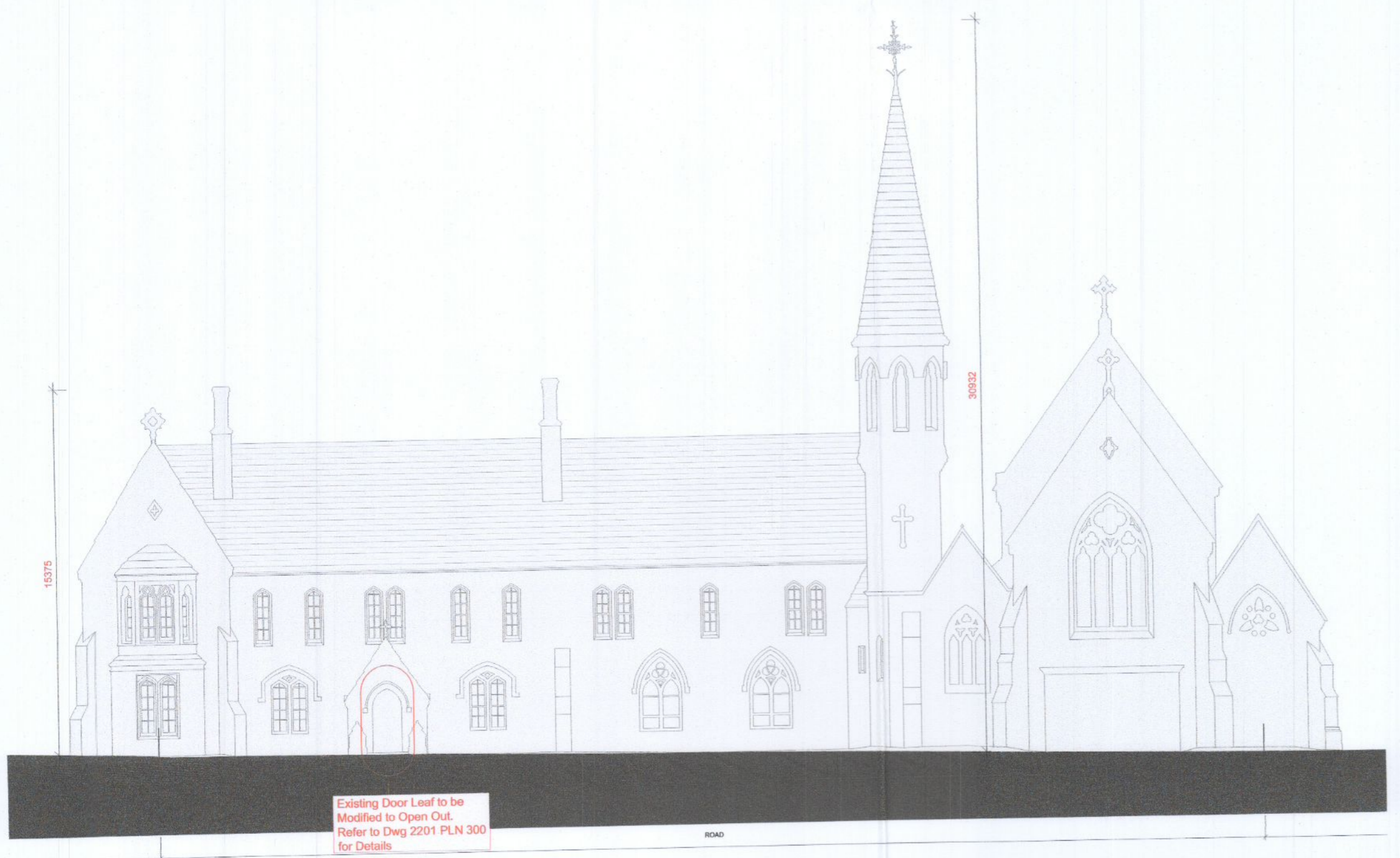
Elevation-03 - East Elevation - Scale 1:200