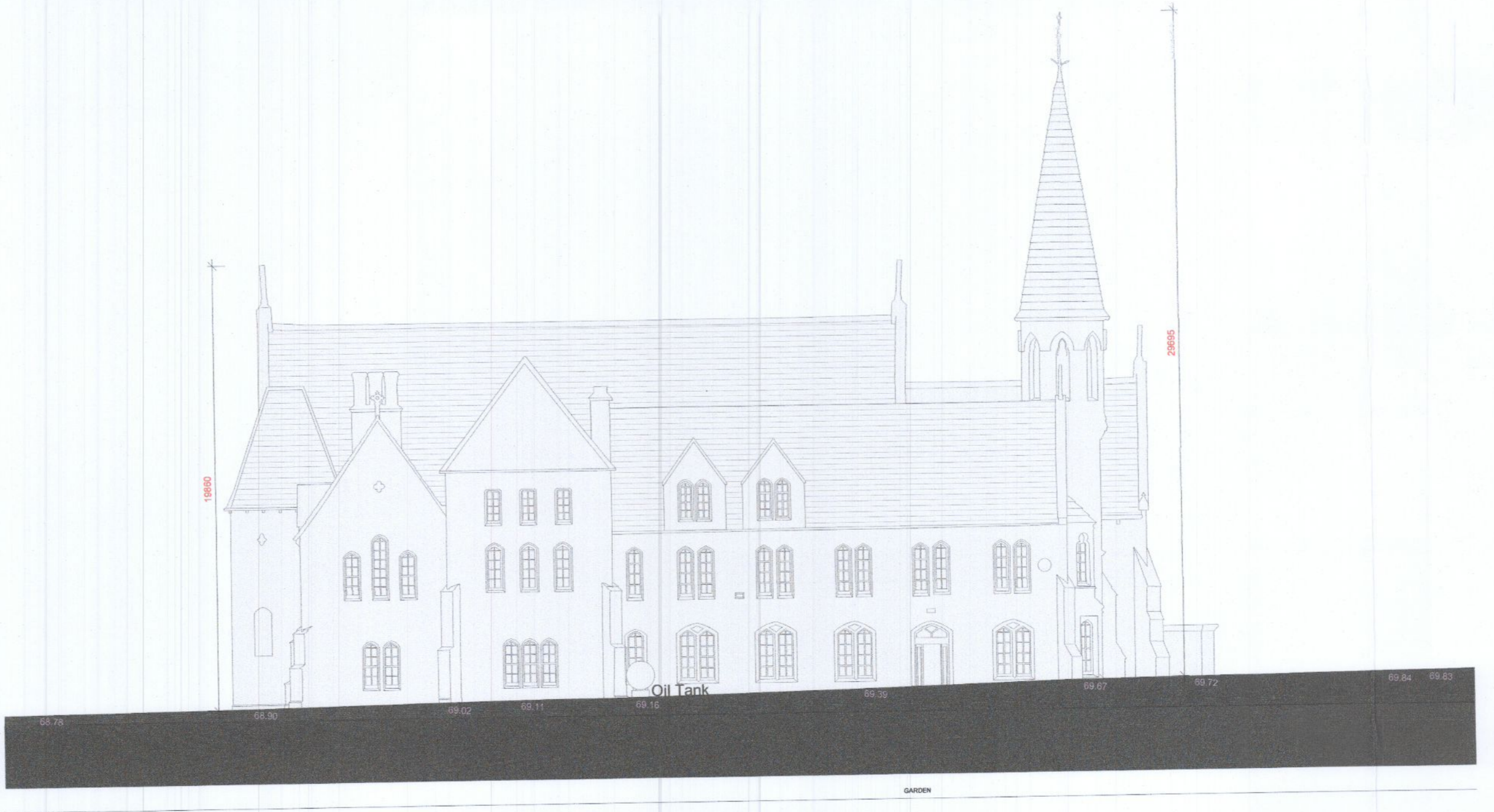
Elevation-04 - South Elevation - Scale 1:200