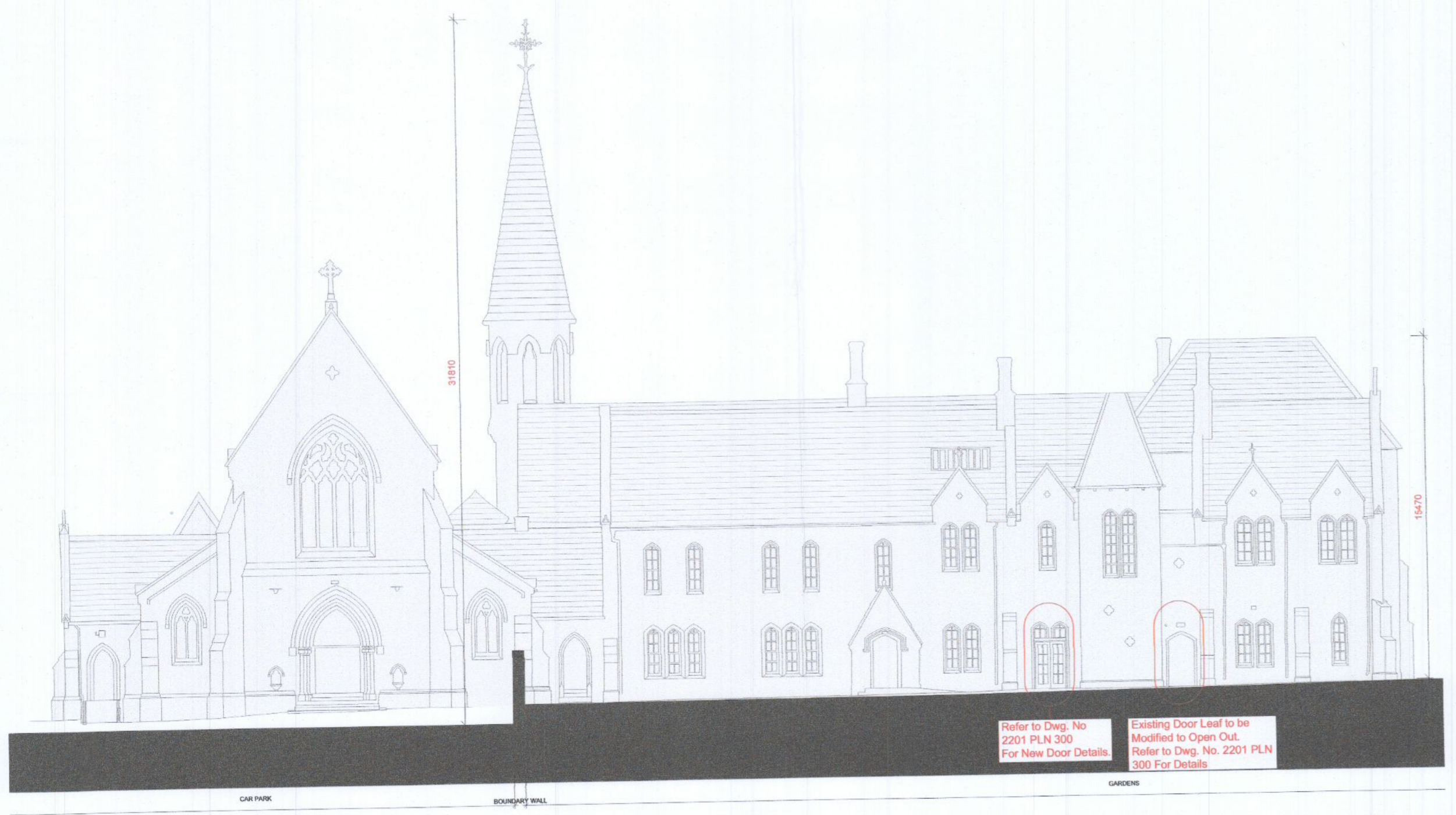
Elevation-01 - West Elevation - Scale 1:200

Materials: Roof: Slate Finish with Lead Valleys Walls: Dressed Limestone Windows/Doors: Painted Hardwood Timber