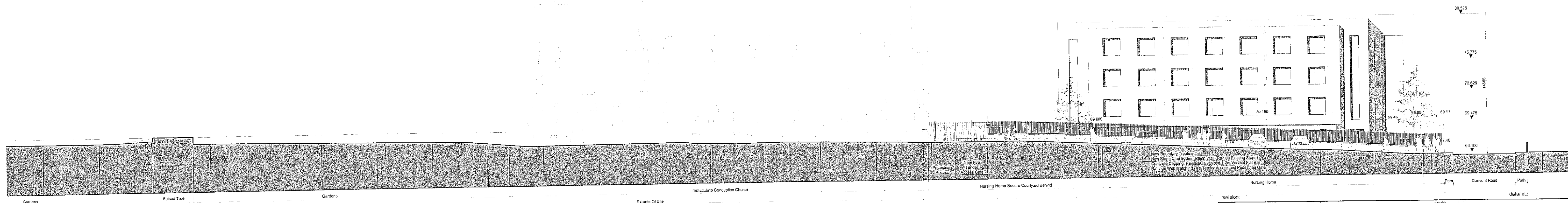
ELEVATION - 03 (NORTH ELEVATION)