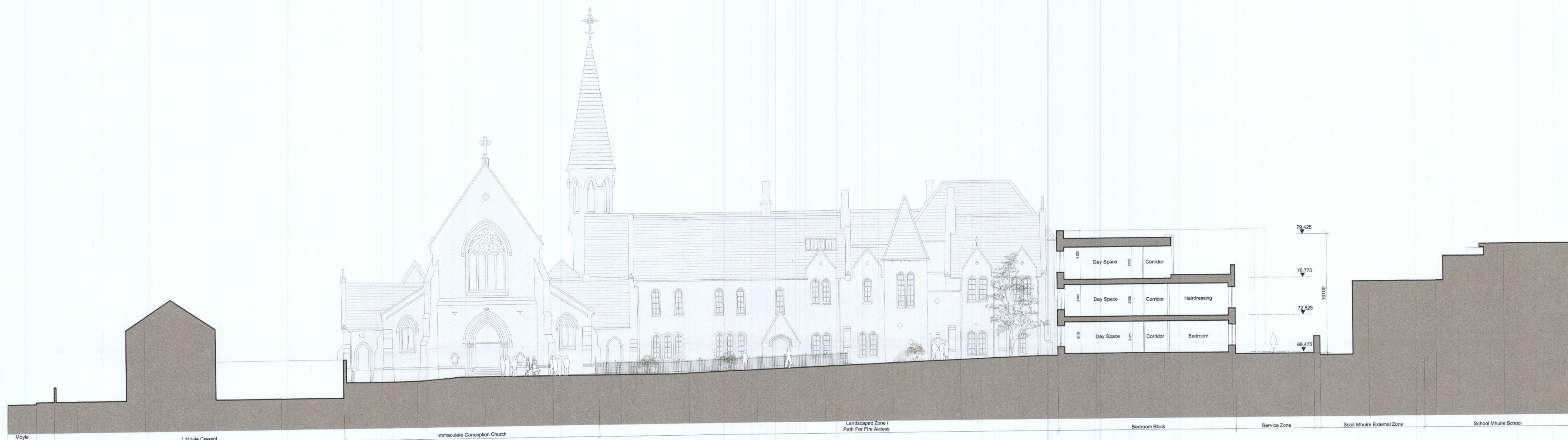
ELEVATION / SECTION - 12 (WEST ELEVATION)