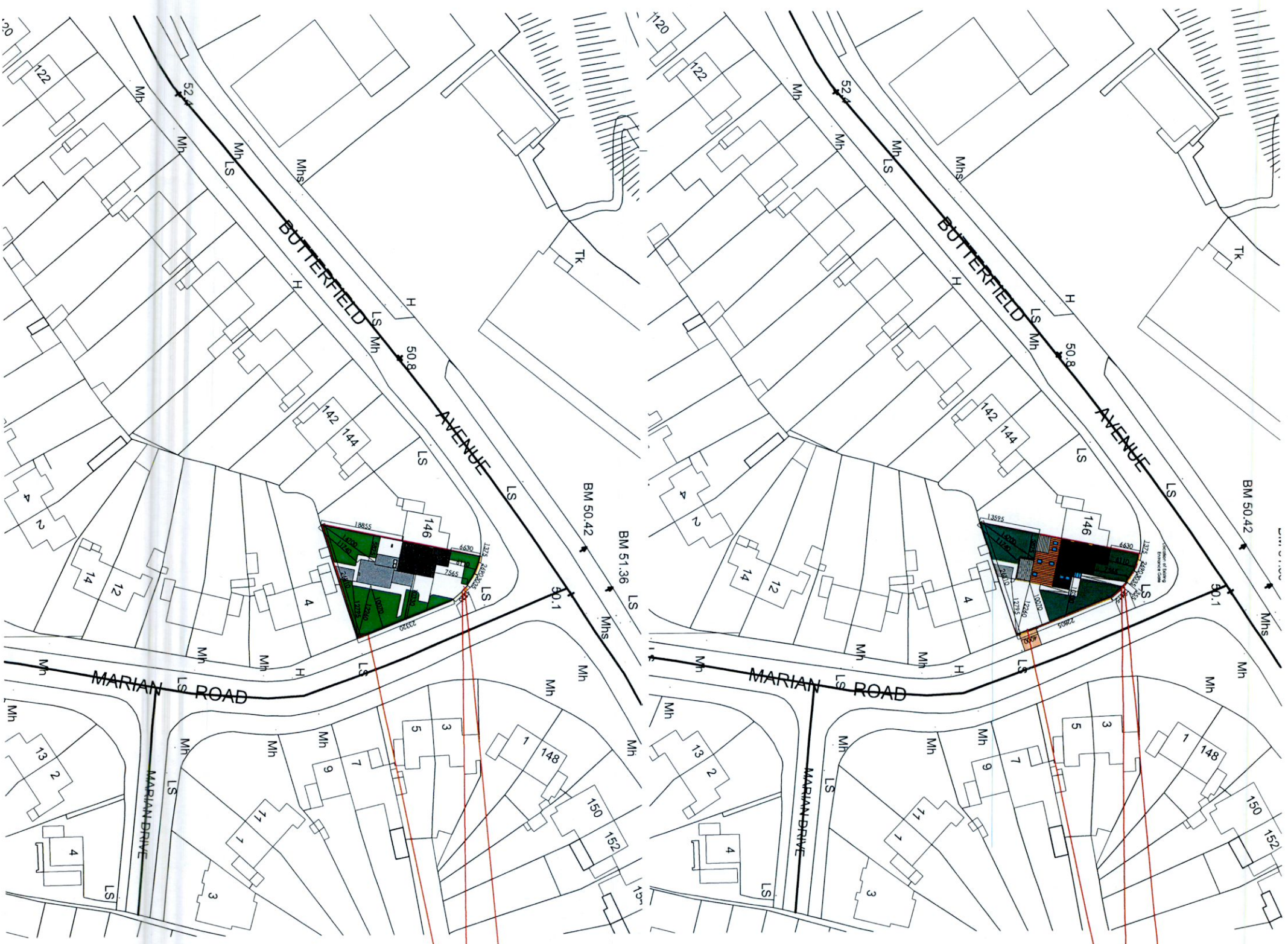
Proposed Location Plan