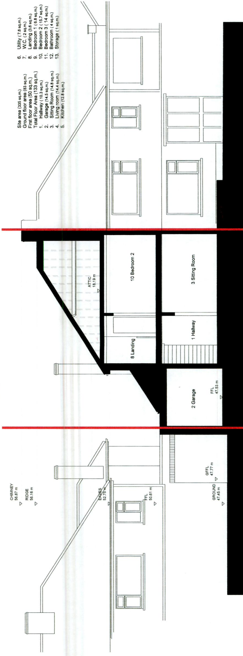
EXISTING SECTION A - A