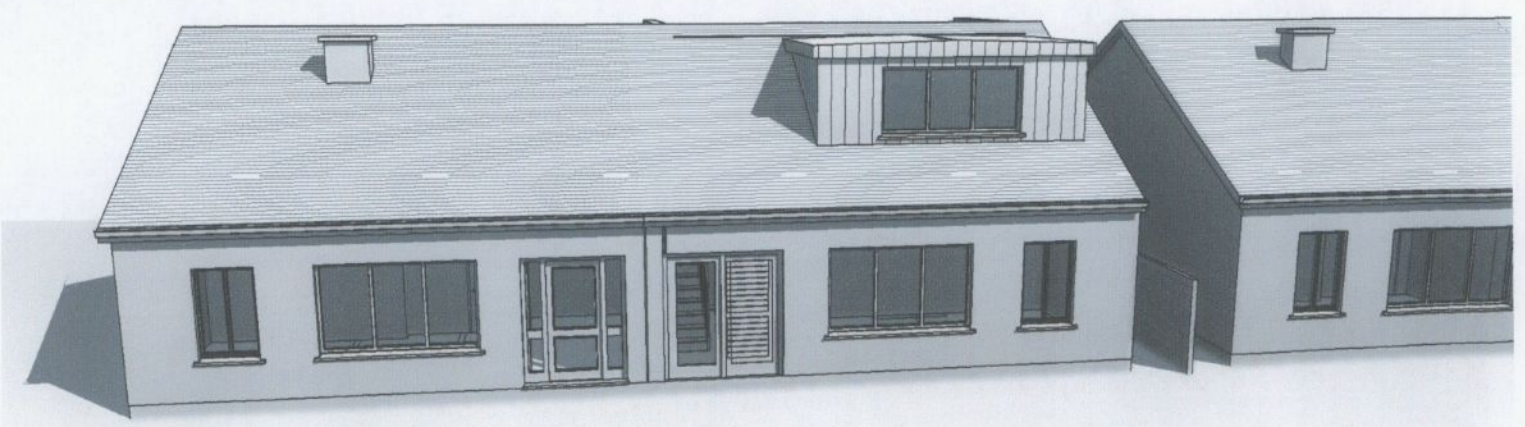
3 3D Perspective 03