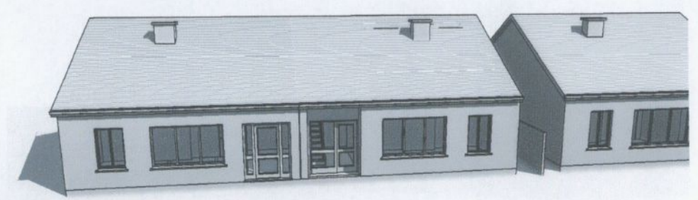
4 3D Perspective 03 Existing