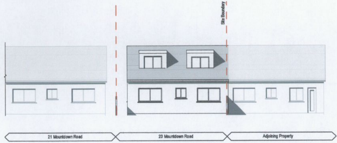
3 Contiguous Elevations Northwest Existing 1 : 200