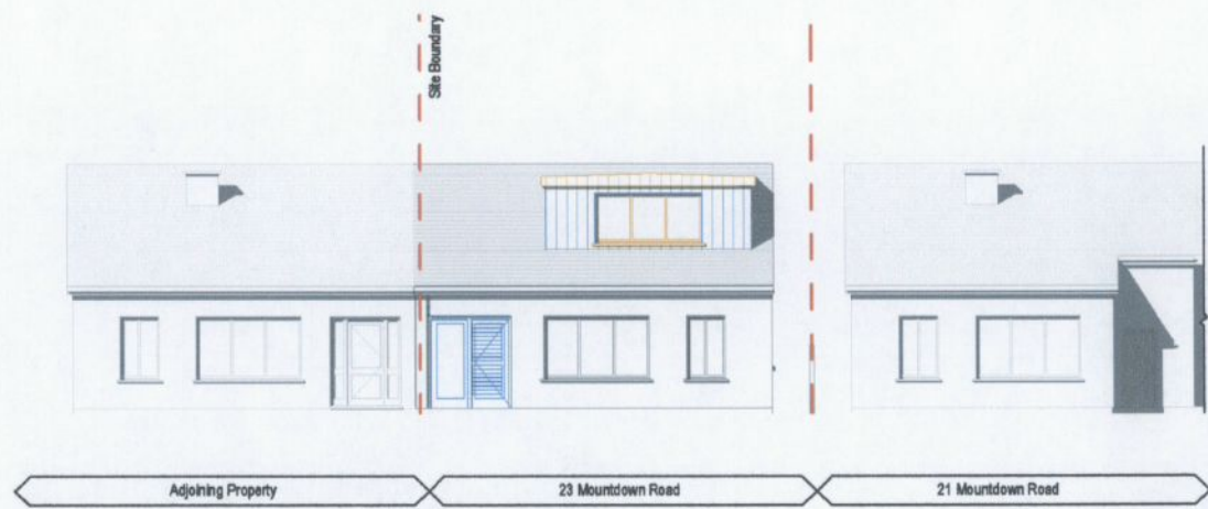
2 Contiguous Elevations Southeast Proposed 1 : 200