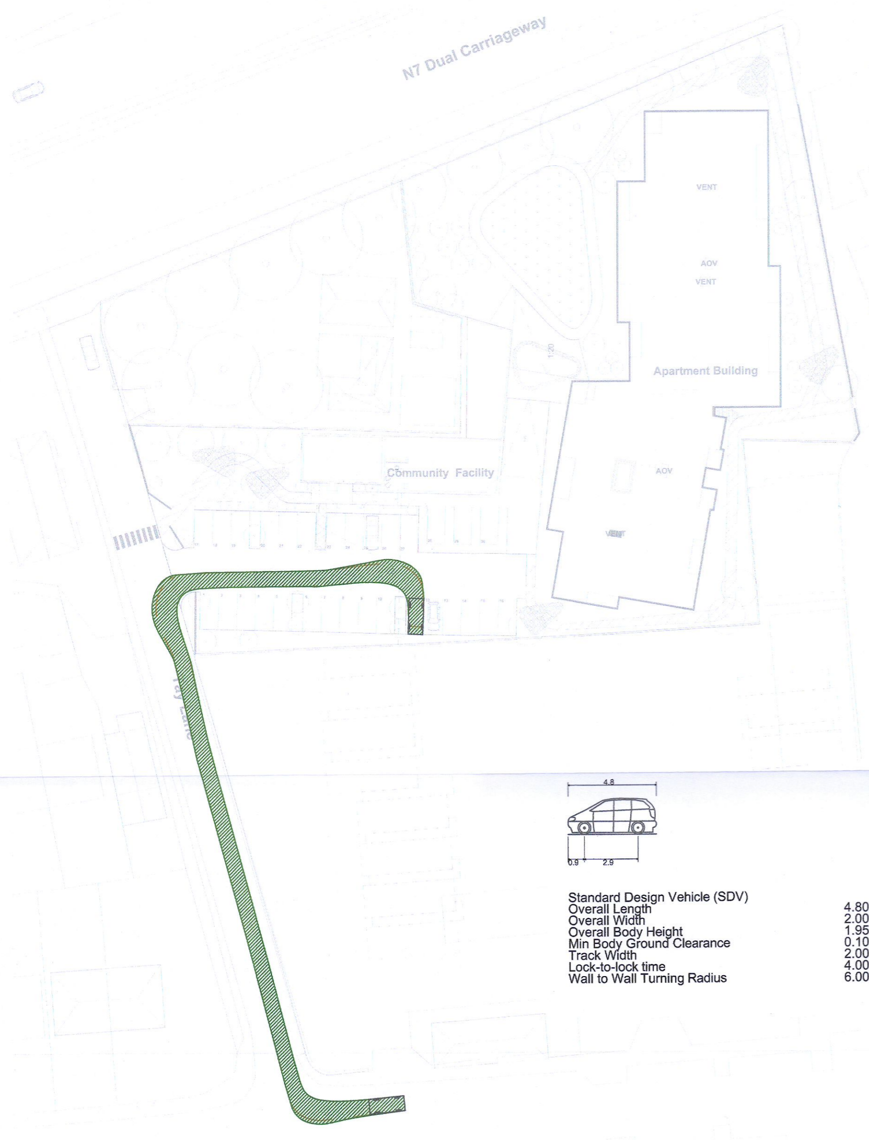
STANDARD DESIGN VEHICLE - EXIT - SPACE 1 SCALE 1:500