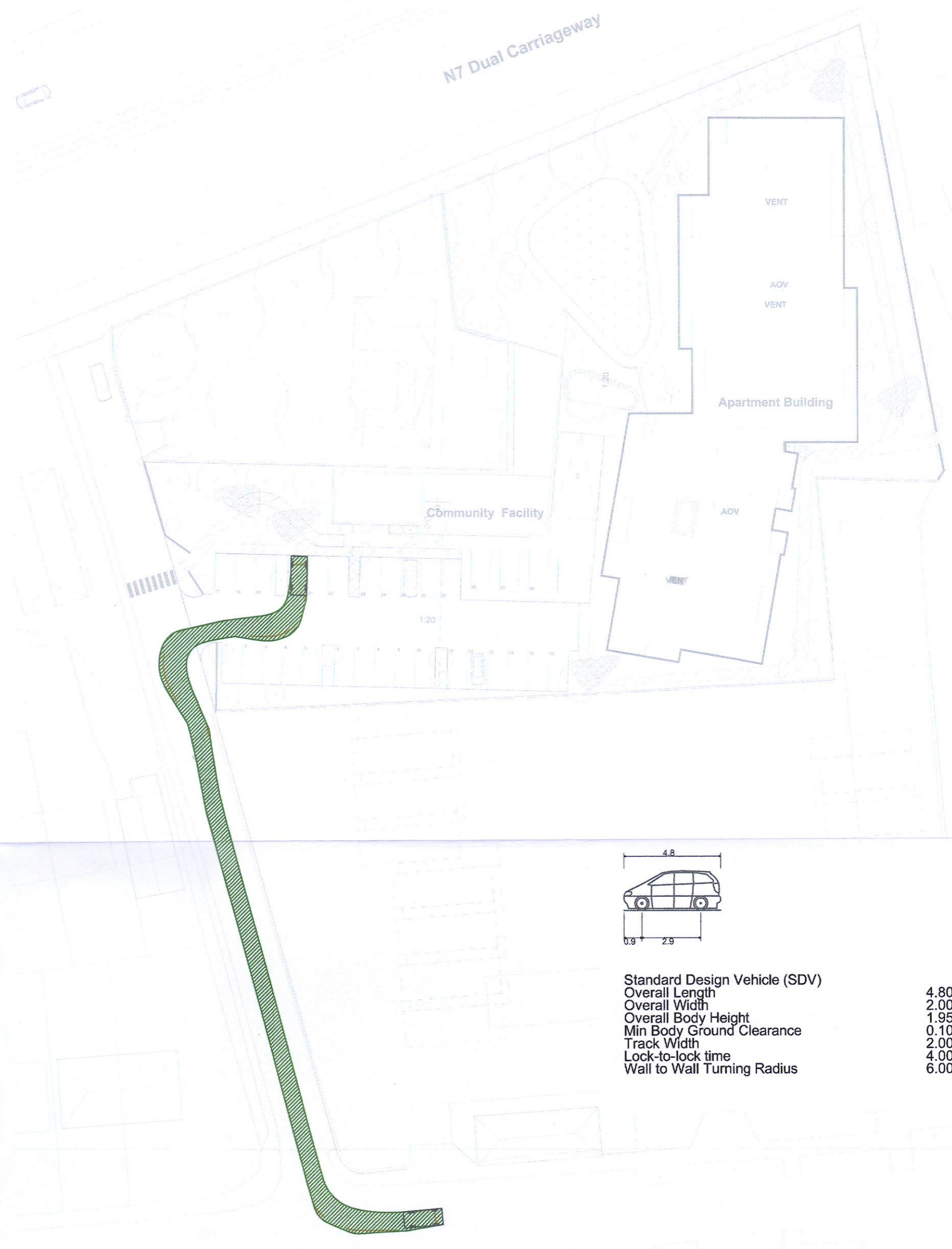
STANDARD DESIGN VEHICLE - EXIT - SPACE 2 SCALE 1:500