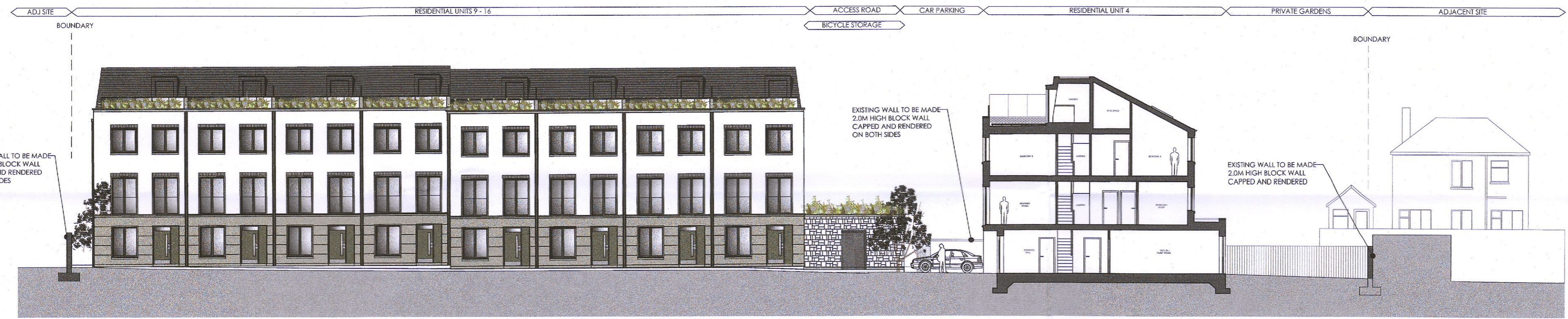
PROPOSED SECTION 2:2 1:200