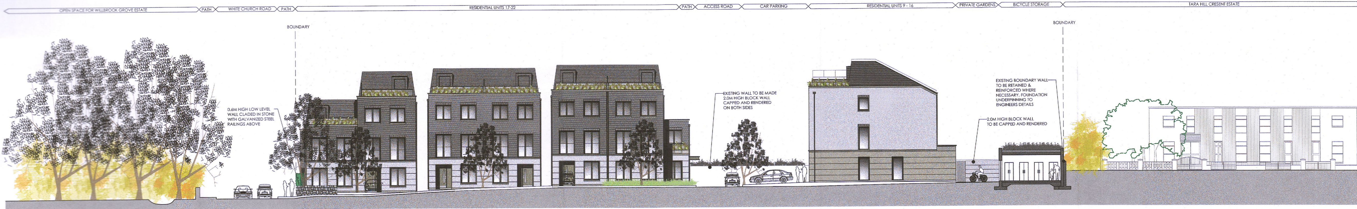
PROPOSED SECTION 3:3 1:200

DO NOT SCALE OFF THIS DRAWING. ONLY STATED DIMENSIONS ARE TO BE USED. ALL DIMENSIONS TO BE VERIFIED ON SITE BY MAIN CONTRACTOR BEFORE THE COMMENCEMENT OF WORKS. REPORT ALL DISCREPANCIES TO ARCHITECT IMMEDIATELY. THIS DRAWING IS TO BE READ WITH ALL RELATED ARCHITECTS AND ENGINEERS' DRAWINGS AND OTHER RELEVANT INFORMATION. TITLE COPYRIGHT AND RIGHT TO USE THIS DOCUMENT RESERVED BY DDQarchitecture . CONSTRUCTION SHOULD ONLY PROCEED FROM DRAWINGS ISSUED UNDER WORKING DRAWINGS (FOR CONSTRUCTION) STATUS, UNLESS PRIOR WRITTEN CONSENT IS GIVEN. SHOULD ANY SITE PERSONNEL OR THOSE EMPLOYED TO CARRY OUT WORKS ON THEIR BEHALF, CHOOSE ALTERNATIVE MATERIALS OR COMPONENTS TO THOSE SPECIFIED BY DDQarchitecture WITHOUT REFERENCE AND AGREEMENT WITH DDQarchitecture , THEN THEY DO SO ENTIRELY AT THEIR OWN RISK.