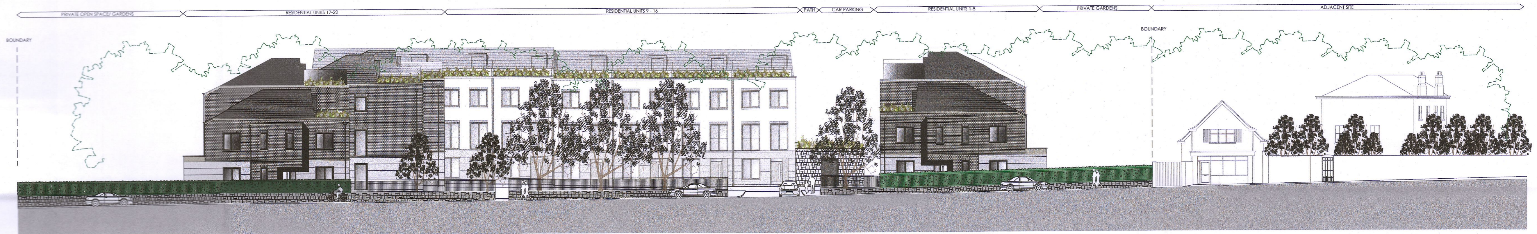
PROPOSED SECTION 1:1 1:200