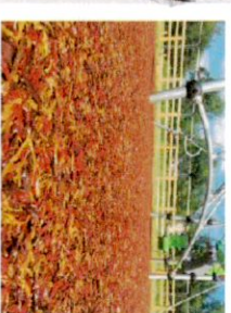
Tiger Mulch safety surface

Proposed Swale Refer to Engineer's Details