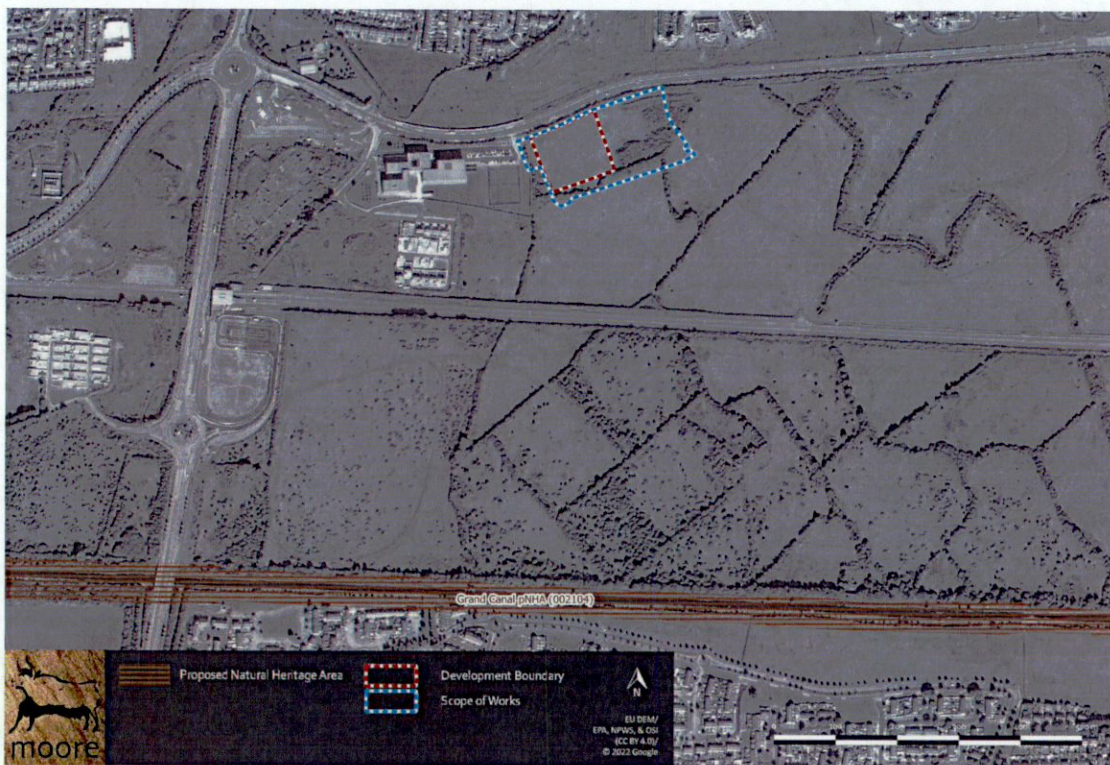
Figure 5. Detailed view of conservation sites in the nearer Potential Zone of Influence of the Proposed Development.