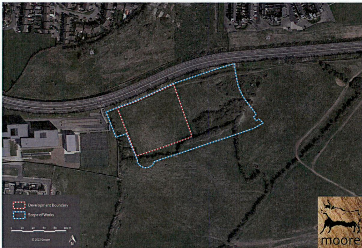
Figure 2. Showing the overall development boundary in blue and the Proposed Development boundary in red on recent aerial photography.