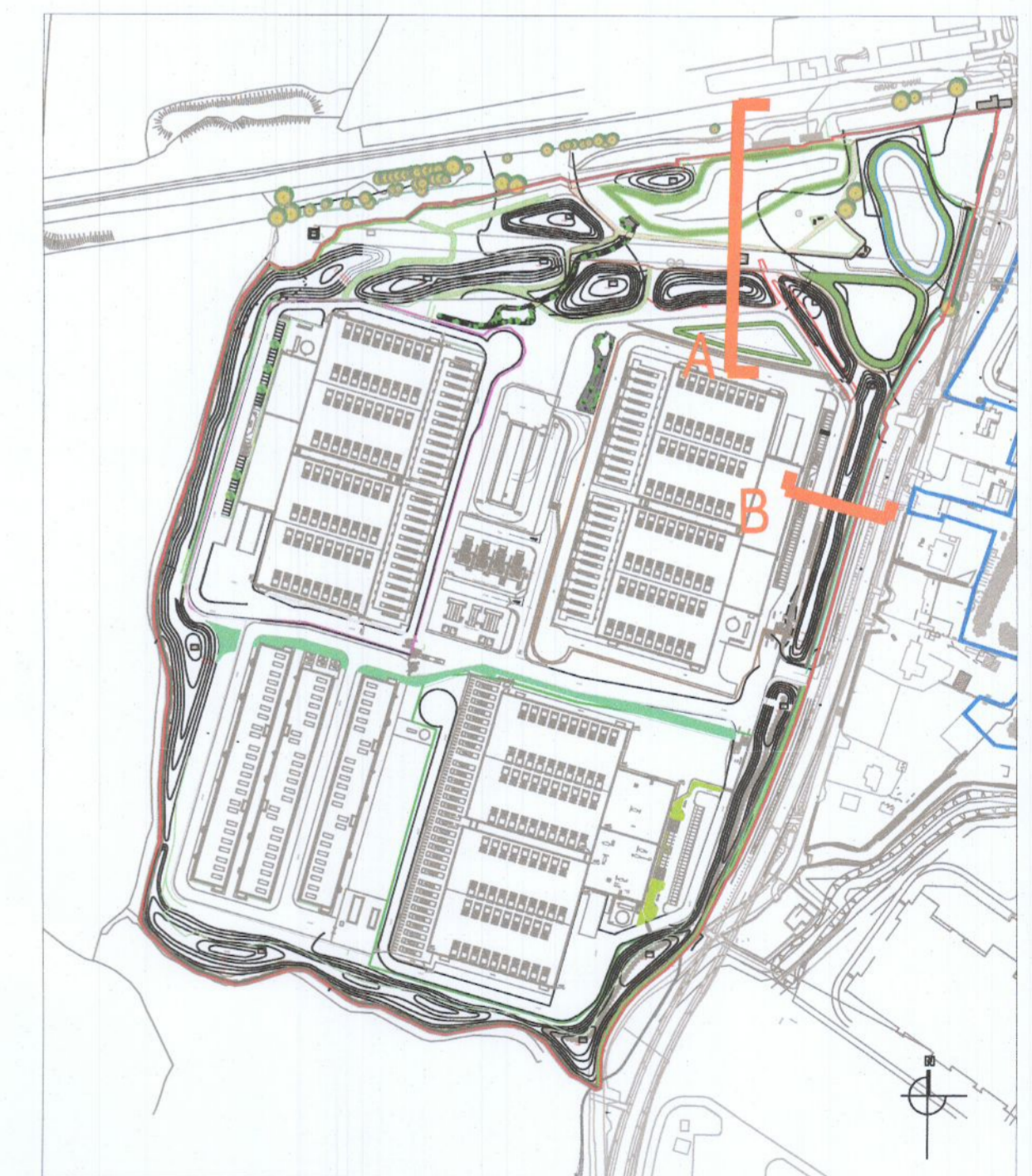
Key Plan | NTS