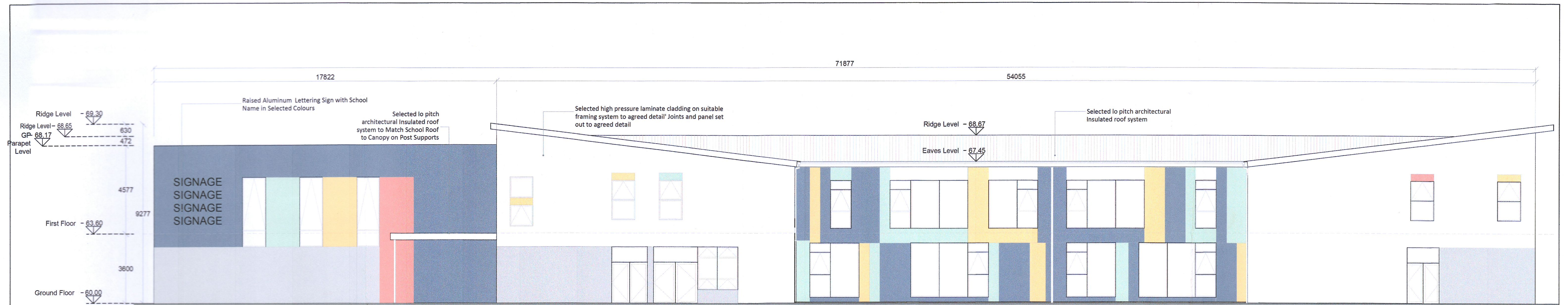
04 4001 PROPOSED EAST ELEVATION 1:100 @ A1