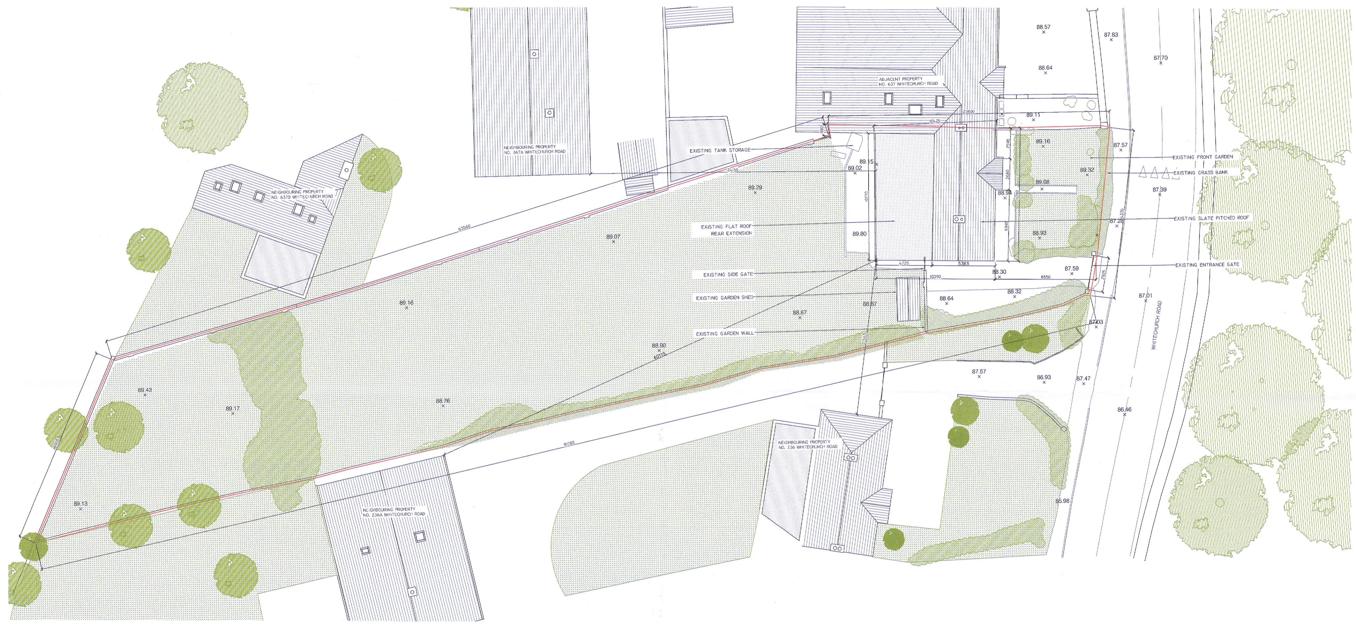
EXISTING SITE PLAN SCALE 1:200