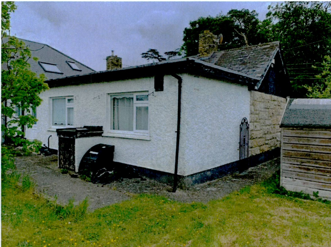
-Rear Elevation and later extension