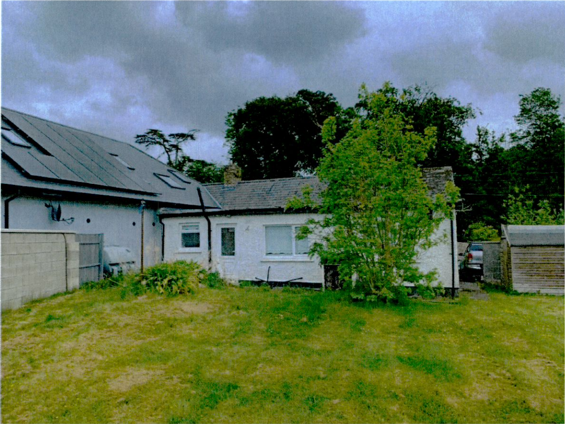
-Rear Elevation with later extension