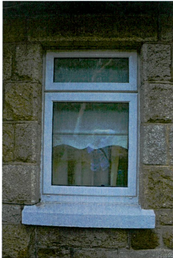
-Example of replacement window