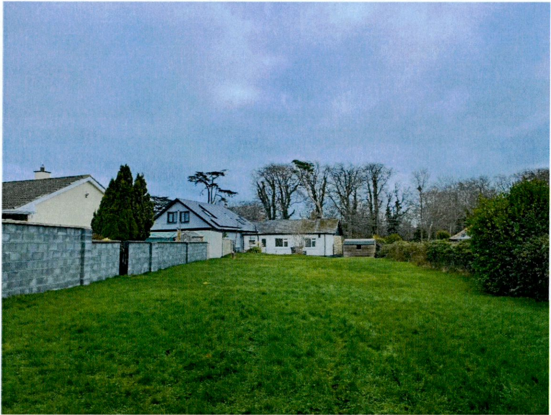
-Rear Elevation from garden