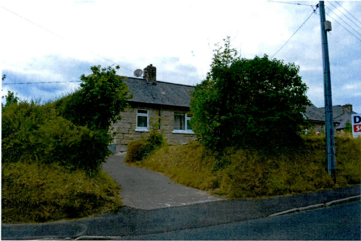
-Entrance driveway from Whitechurch Road