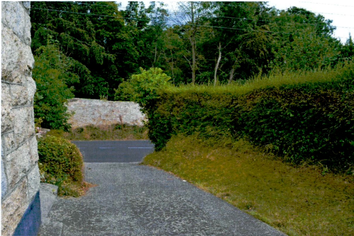
-Entrance driveway looking towards Whitechurch Road