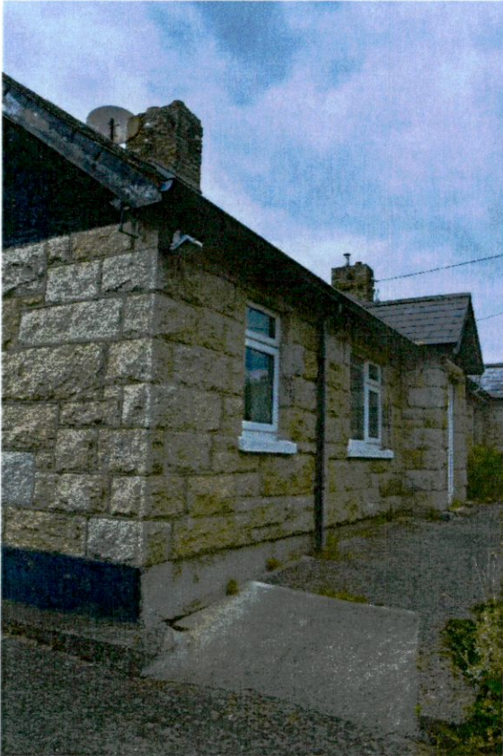
-Front porch with non-original window and door