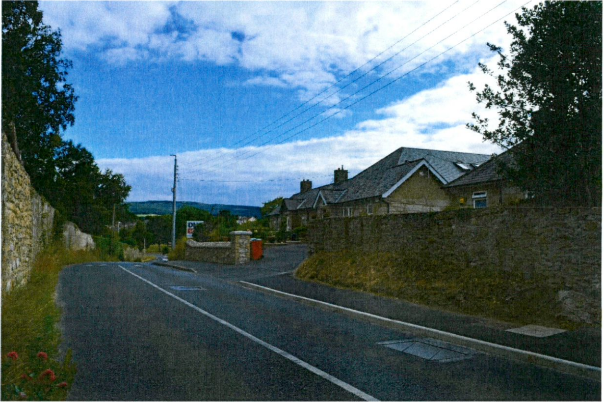
-Front Streetscape with adjoined property