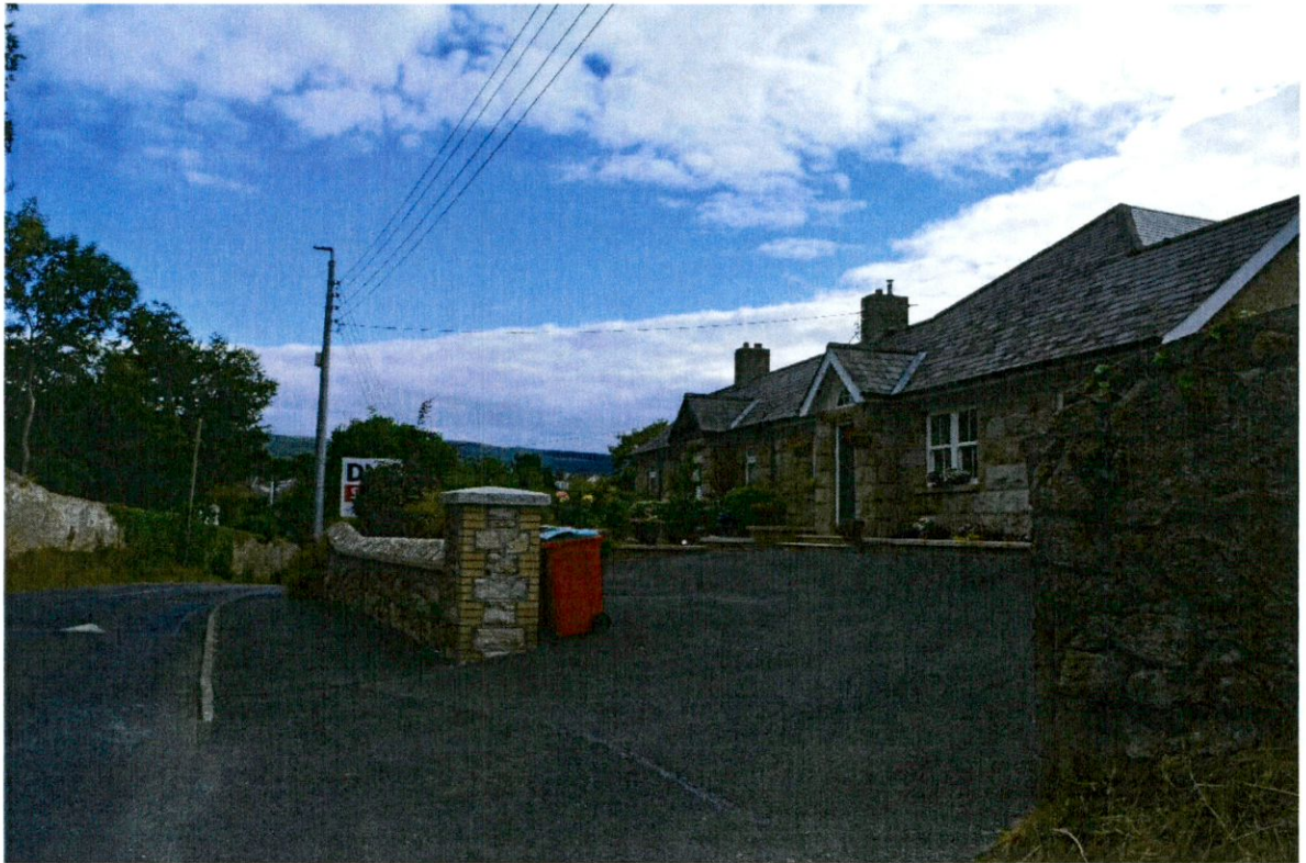
-Front elevation with adjoined property