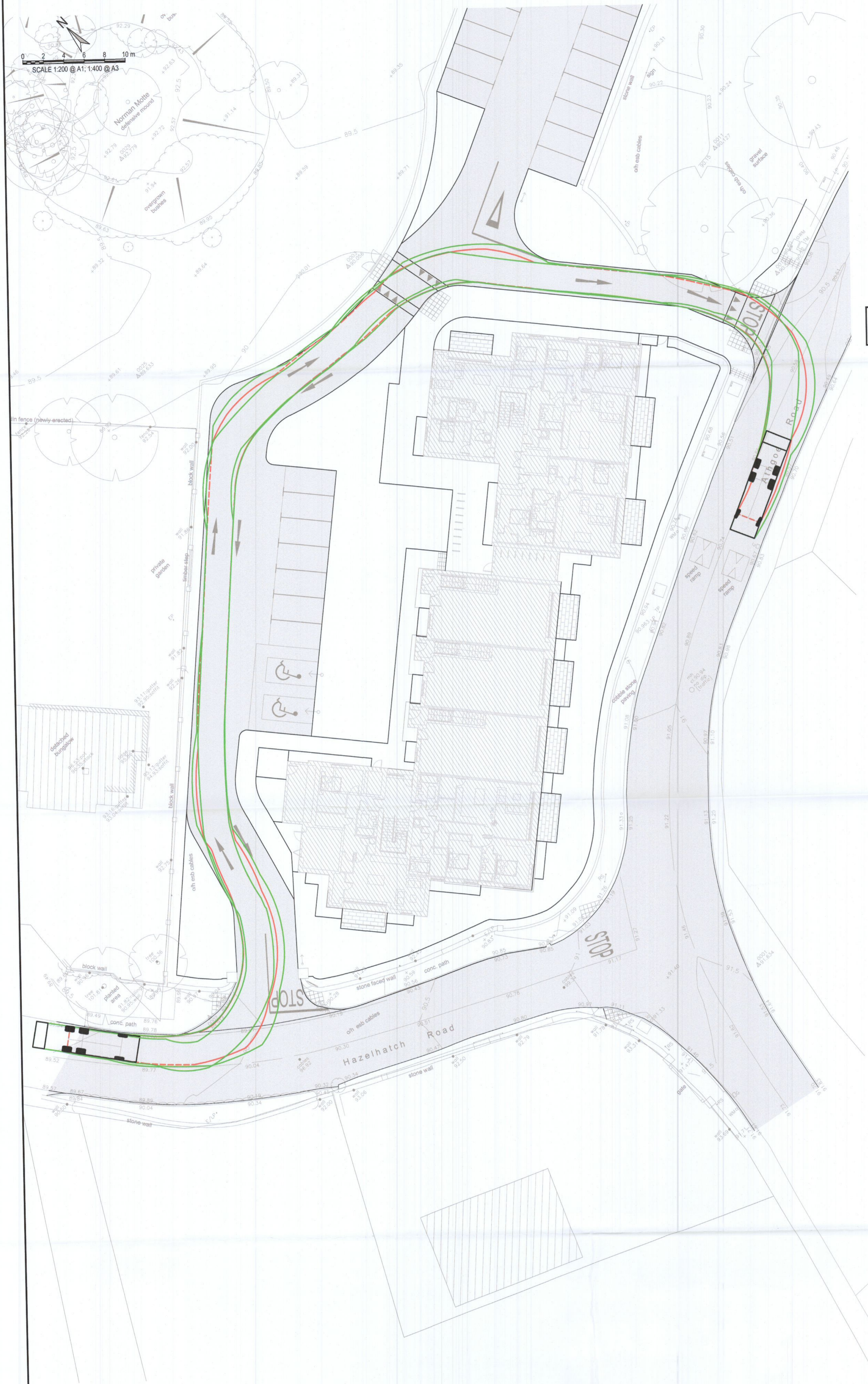
10.2m VEHICLE SWEPT PATH ANALYSIS SCALE 1:200