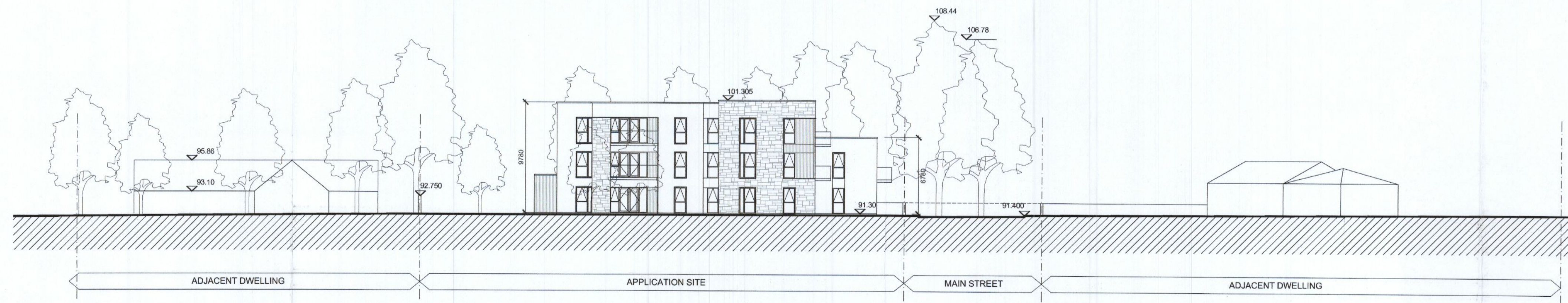
CONTIGUOUS SOUTH EAST ELEVATION SCALE 1:250