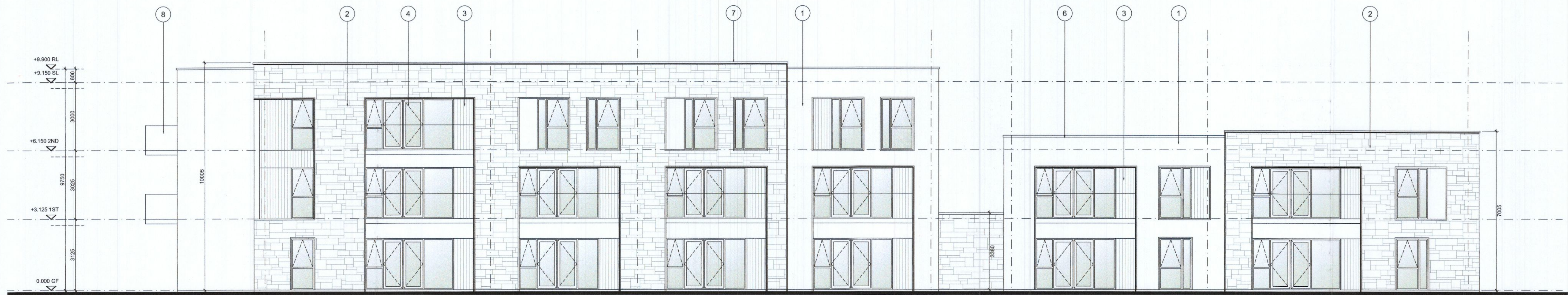
SOUTH WEST ELEVATION SCALE 1:100

LEVELS: REFER TO SITE PLAN FOR BLOCK LEVELS