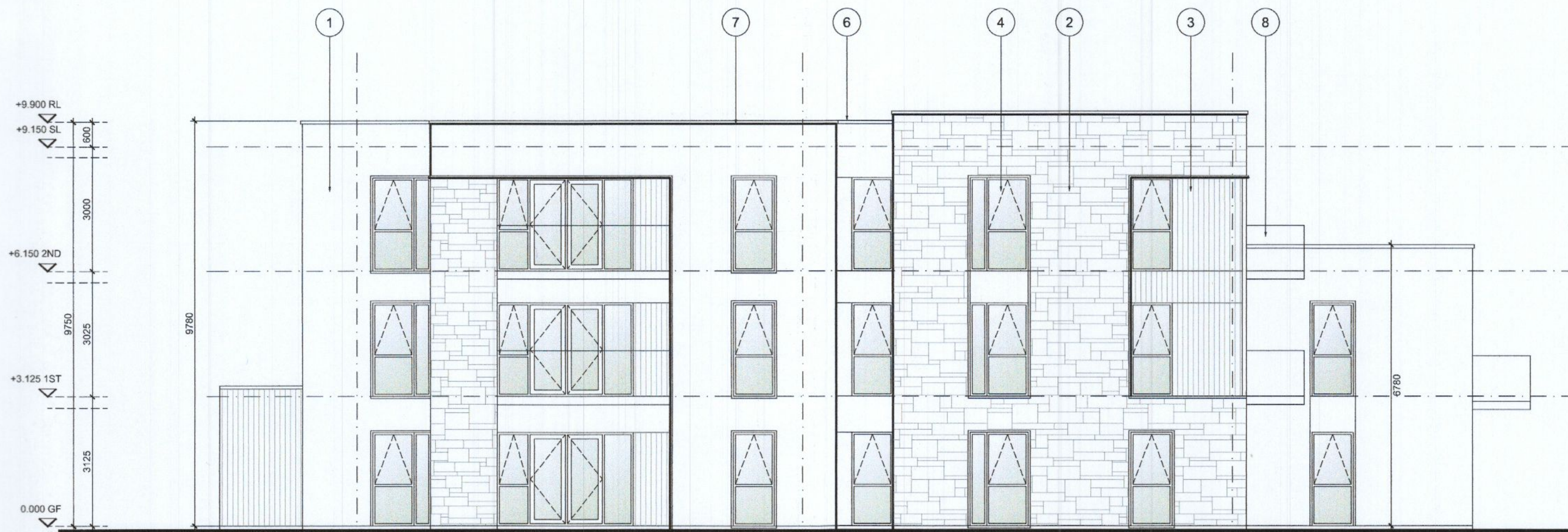
SOUTH EAST ELEVATION SCALE 1:100