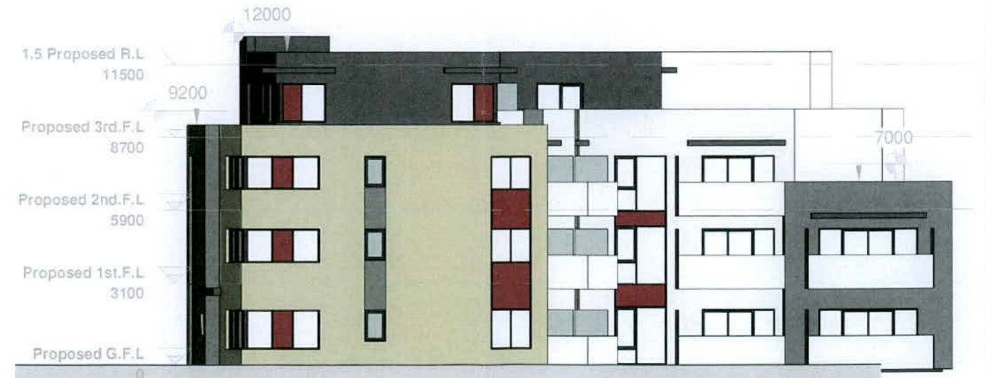
2.4 West Elevation Scale: 1 : 200