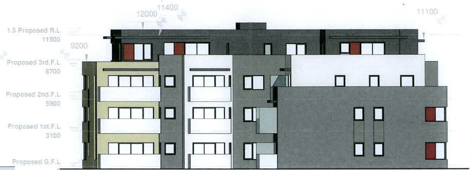
2.2 South Elevation Scale: 1 : 200

Apartment Unit 1- 2 bedrooms proposed for Part V Apartment Unit 2- 1 bedroom proposed for Part V