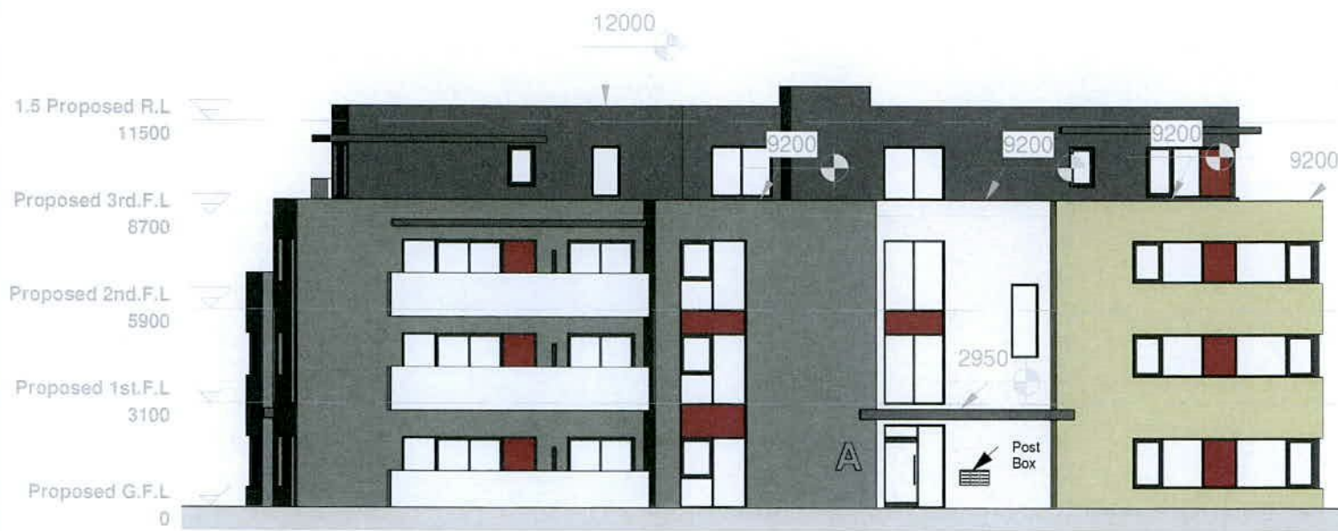
2.1 North Elevation Scale: 1 : 200