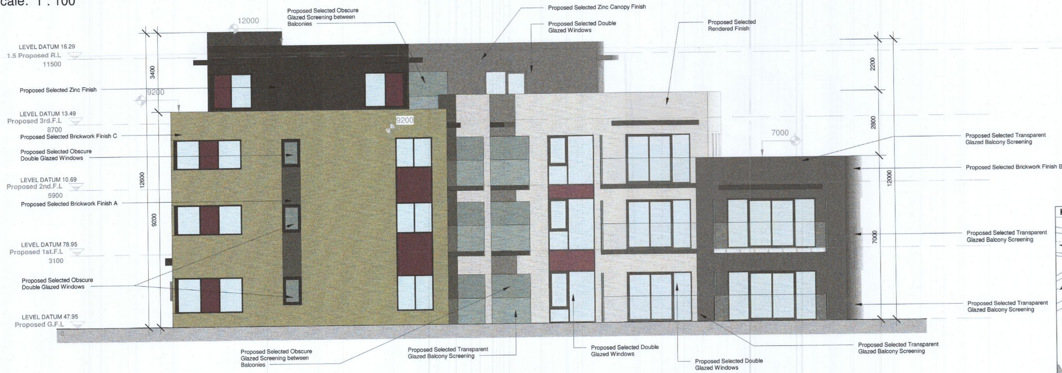
2.4 Proposed West Elevation Scale: 1 : 100