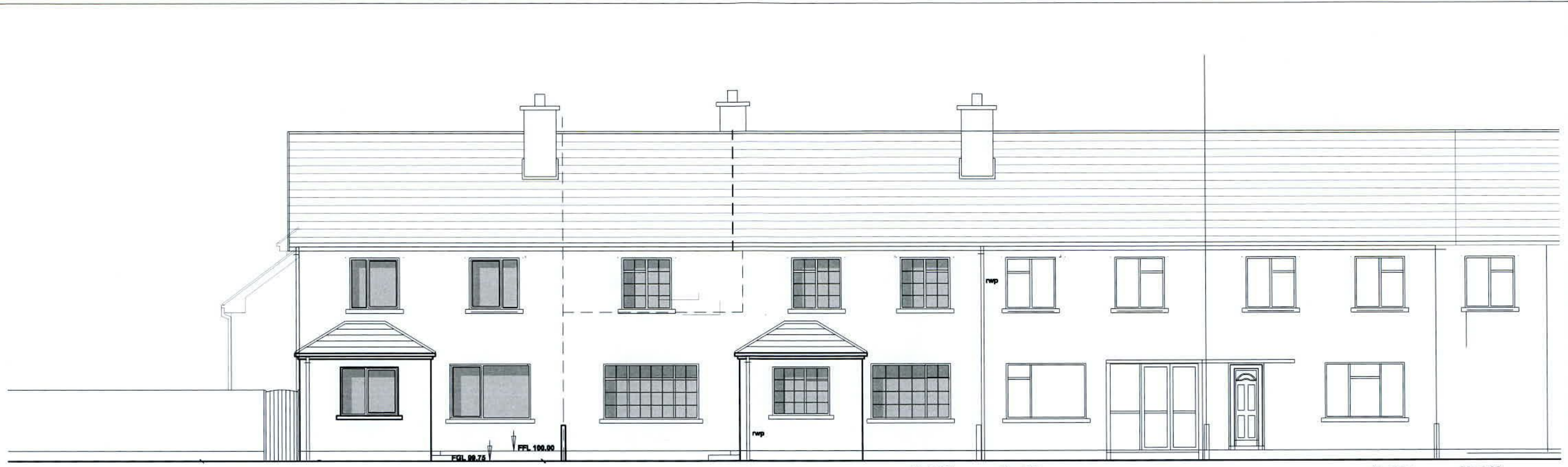
PROPOSED CONTIGUOUS FRONT ELEVATION