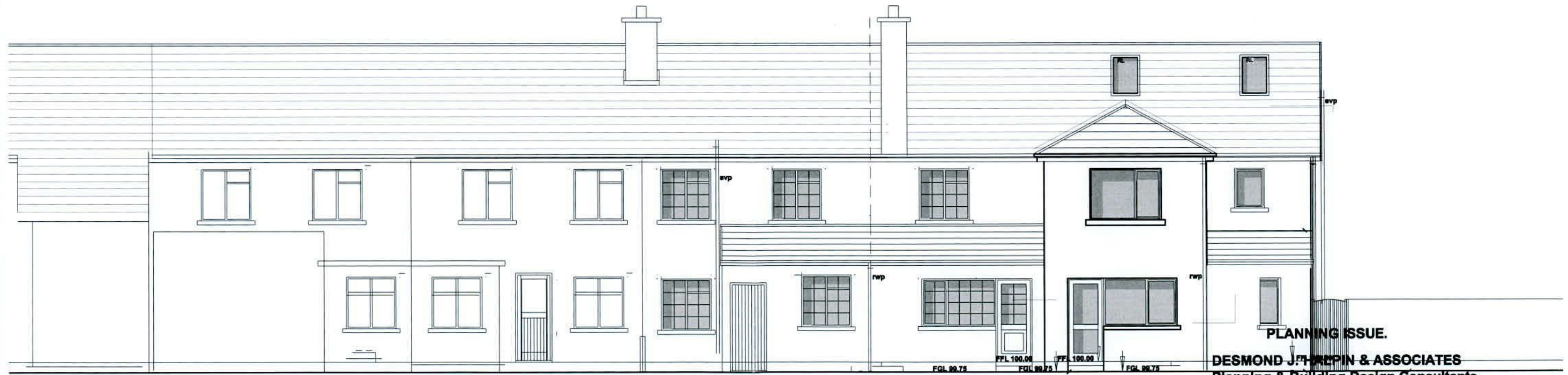
PROPOSED CONTIGUOUS REAR ELEVATION