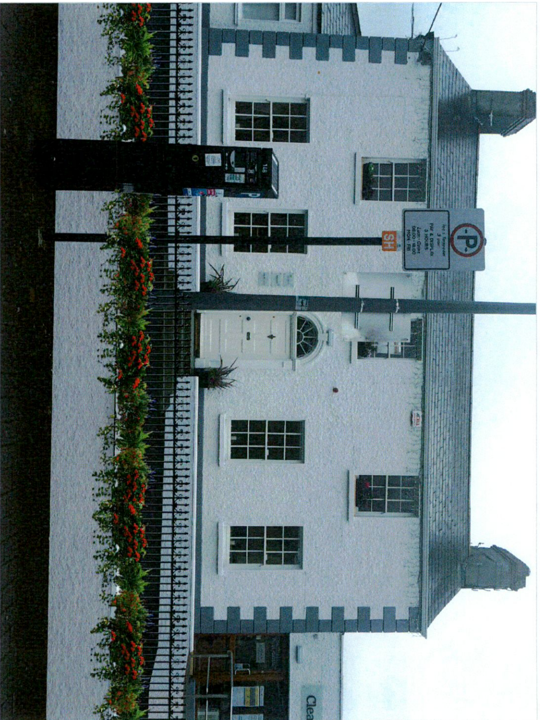
EXISTING BOUNDARY WALL