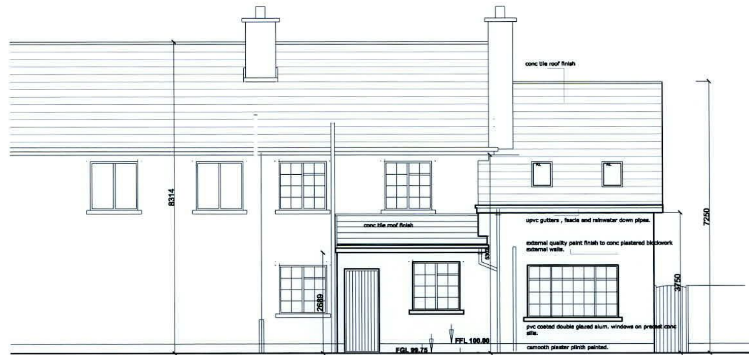
No145 No146 EXISTING REAR ELEVATION.