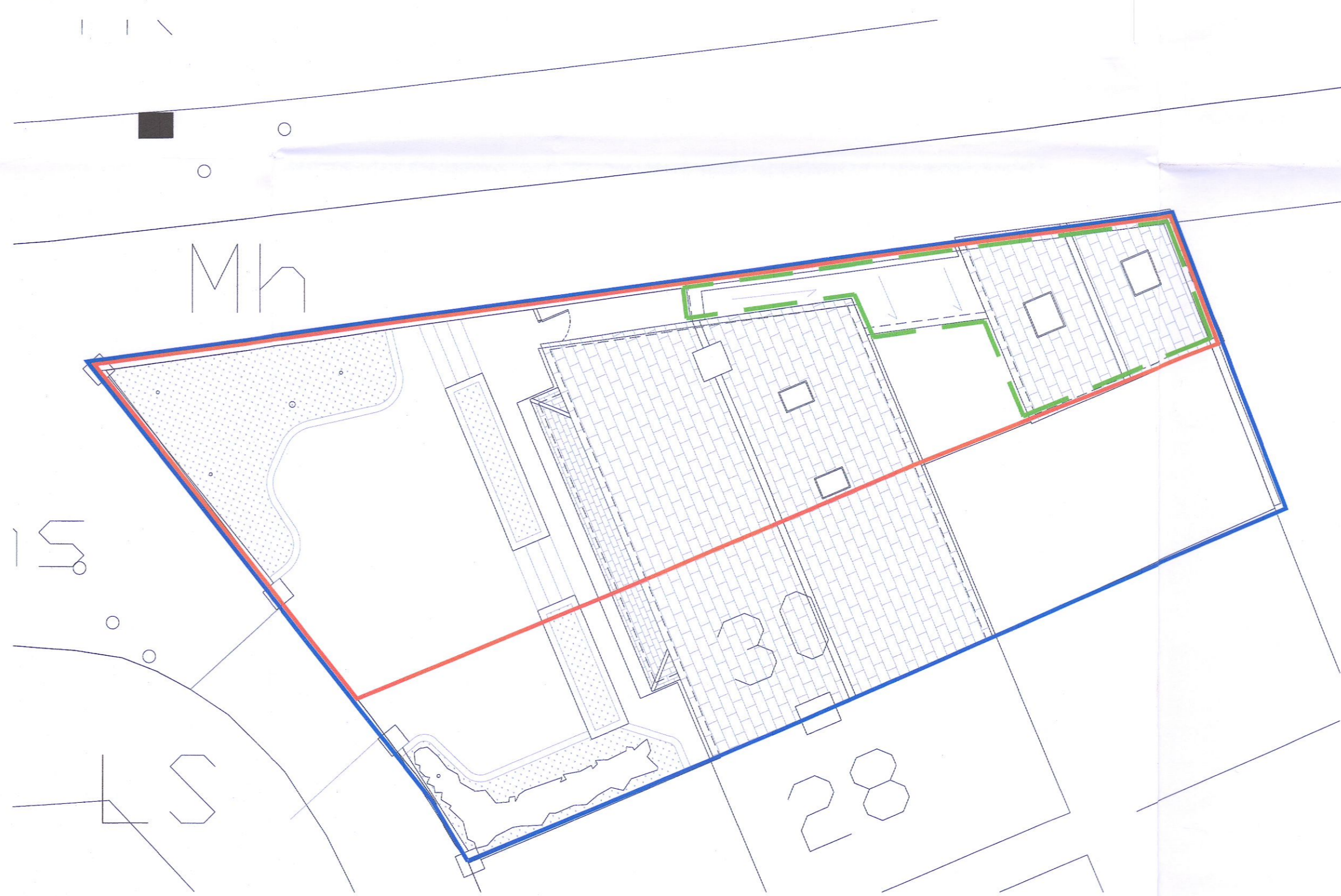
3 Proposed Site Layout scale 1:125 @ A1