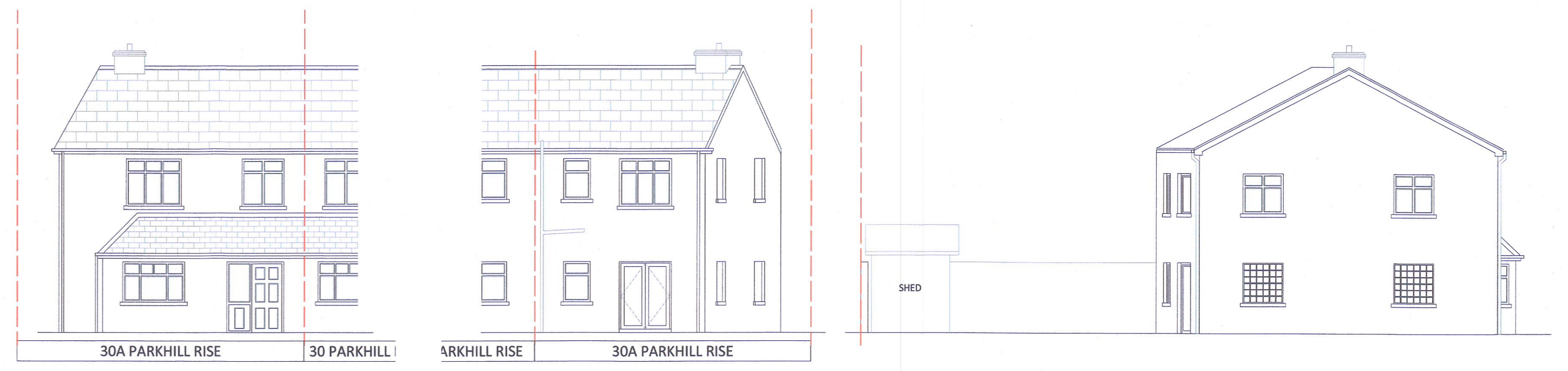
4 Existing Front Elevation scale 1:75 @ A1 5 Existing Rear Elevation scale 1:75 @ A1 6 Existing Side Elevation scale 1:75 @ A1

Site Boundary Outlined in Red Site Area :212m 2