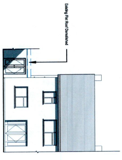
4 East Elevation Demolition 1 : 200