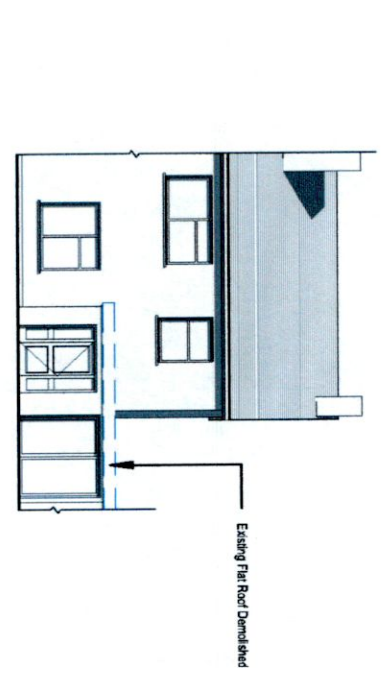
5 West Elevation Demolition 1 : 200