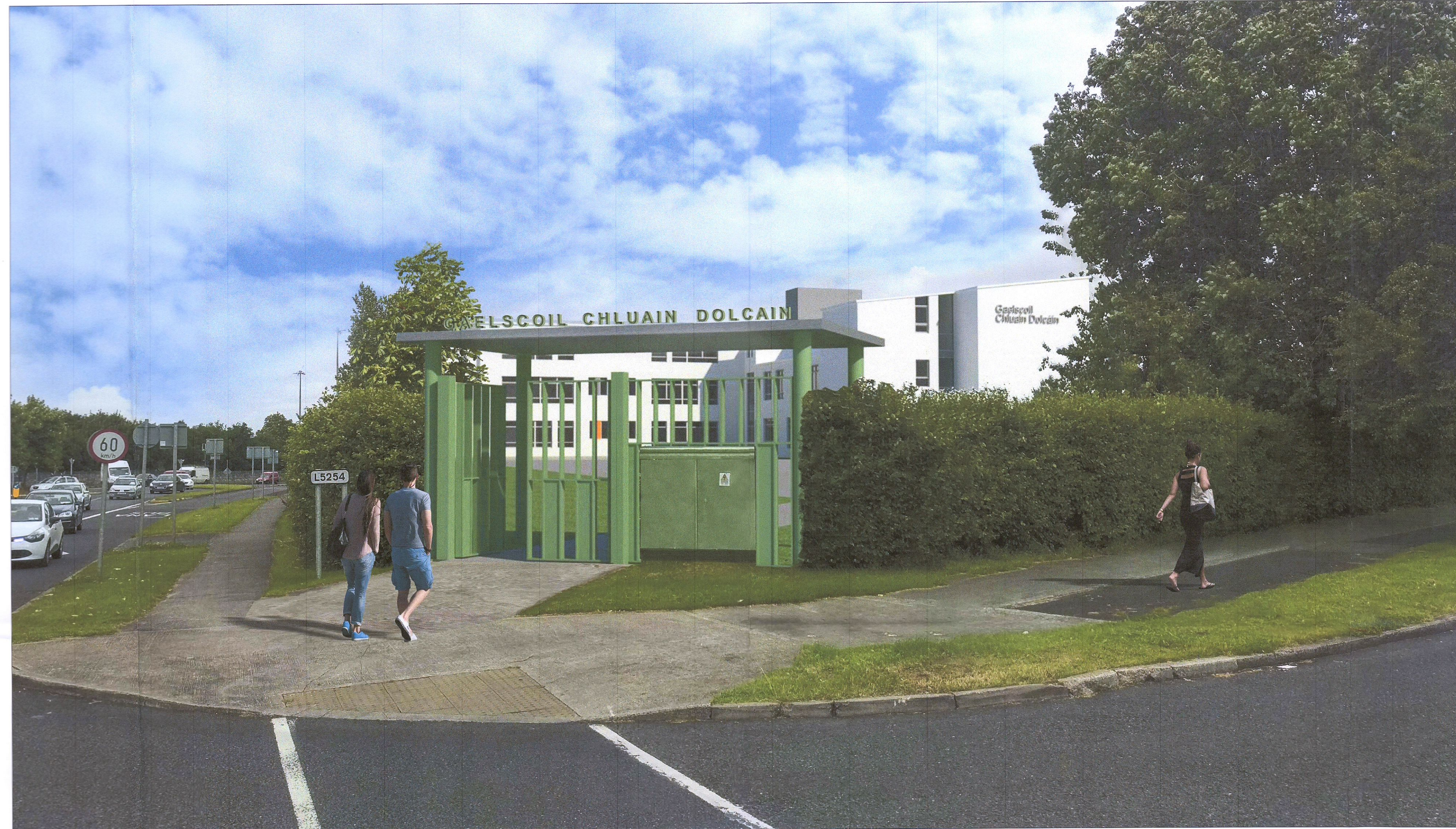
01 PROPOSED VIEW TO PEDESTRIAN (G-01) GATEWAY AT CORNER OF NANGOR ROAD SCALE: NTS

© No dimensions to be scaled from this drawing. All dimensions to be checked by the contractor on site, any errors or discrepancies to be reported to the Architects.