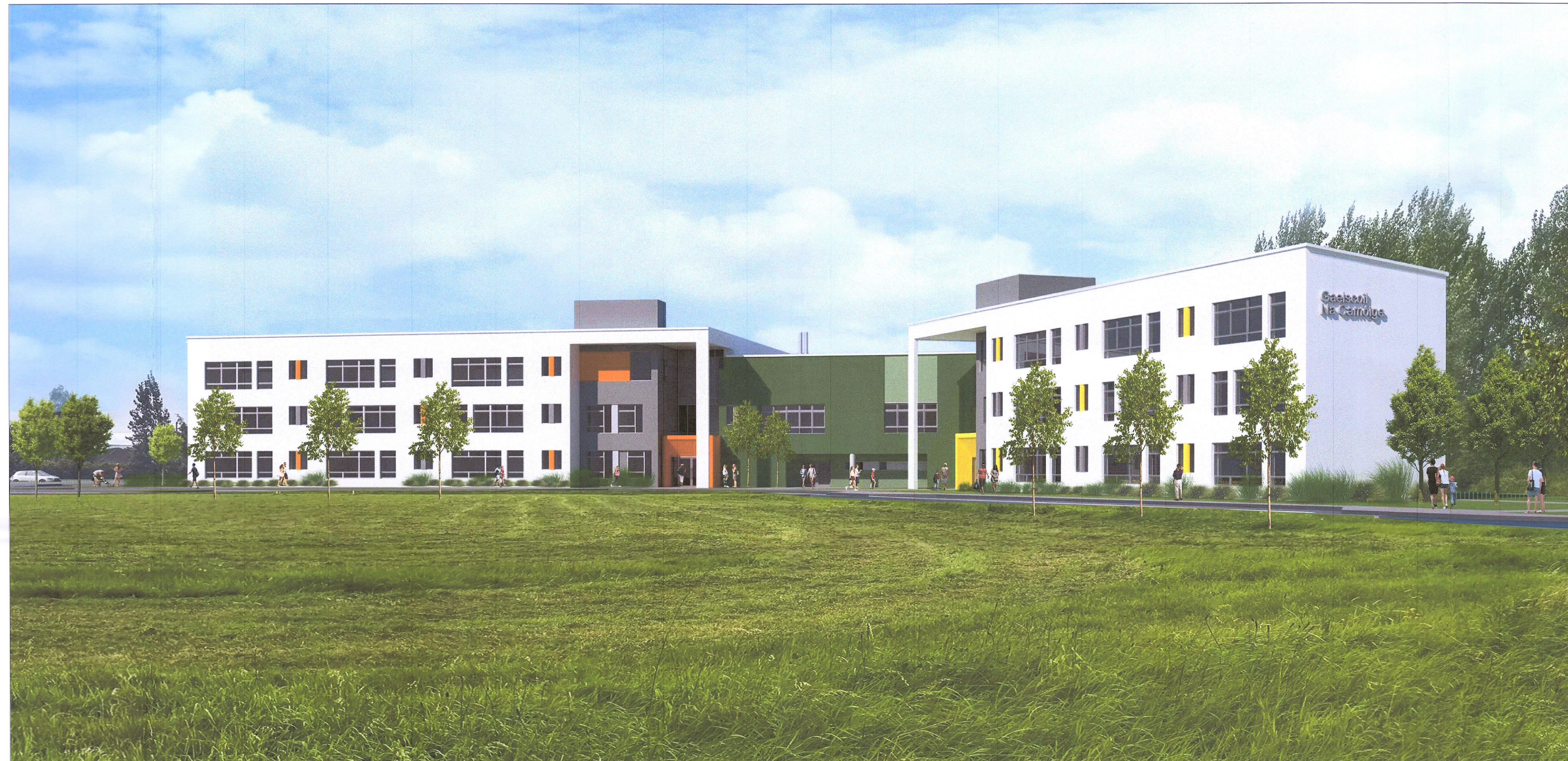
01 P902 PROPOSED VIEW FROM PLAYING PITCH SCALE: NTS

© No dimensions to be scaled from this drawing. All dimensions to be checked by the contractor on site, any errors or discrepancies to be reported to the Architects.