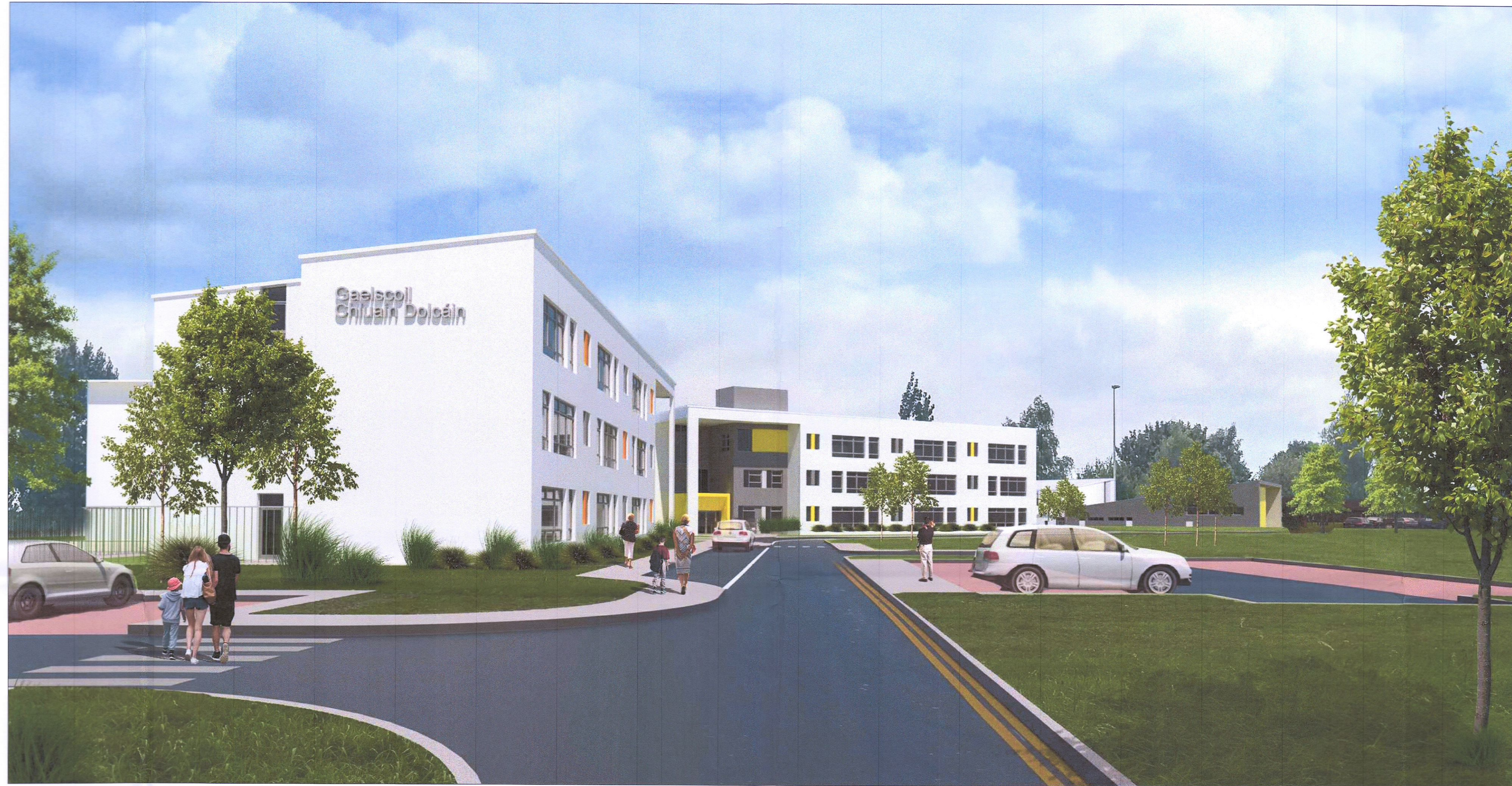
01 P901 PROPOSED VIEW FROM ENTRANCE AT OLD NANGOR ROAD SCALE: NTS

© No dimensions to be scaled from this drawing. All dimensions to be checked by the contractor on site, any errors or discrepancies to be reported to the Architects.