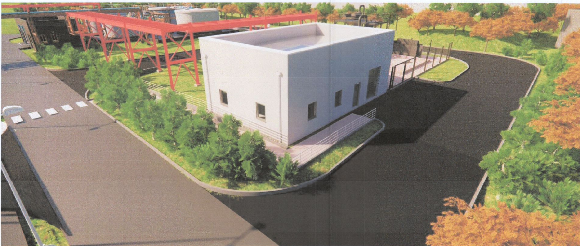
C - PROPOSED VIEW FROM NORTH-EAST TO UTILITIES BUILDING