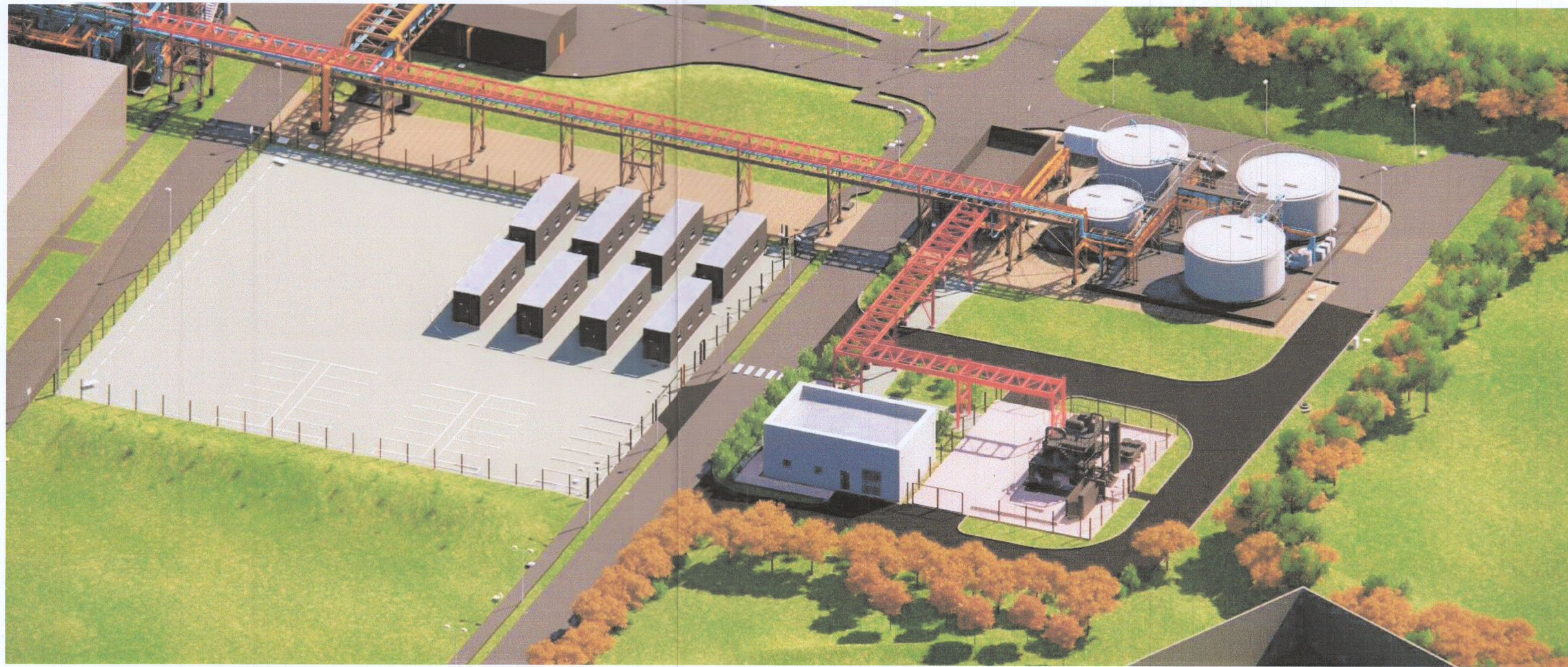
A - PROPOSED NORTH-WEST SITE VIEW