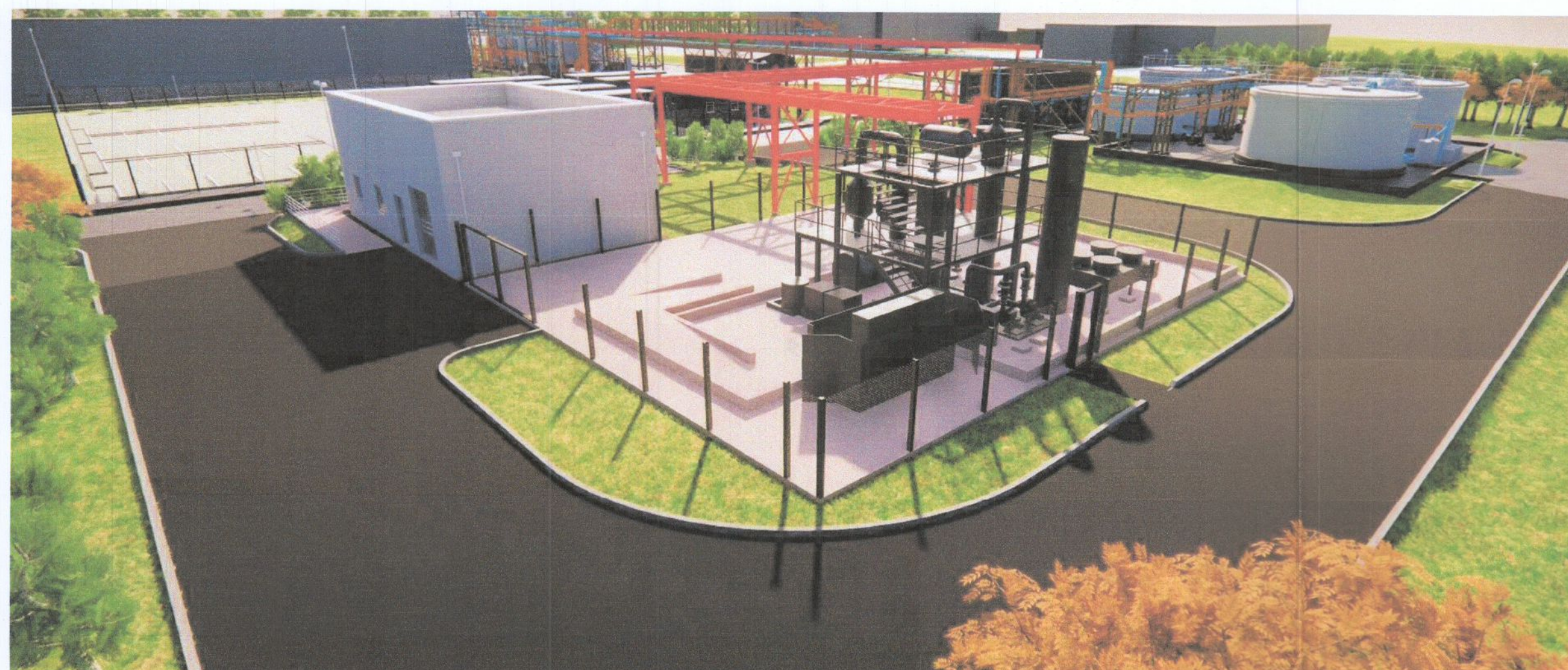
D - PROPOSED VIEW FROM NORTH-WEST TO VOC COMPOUND