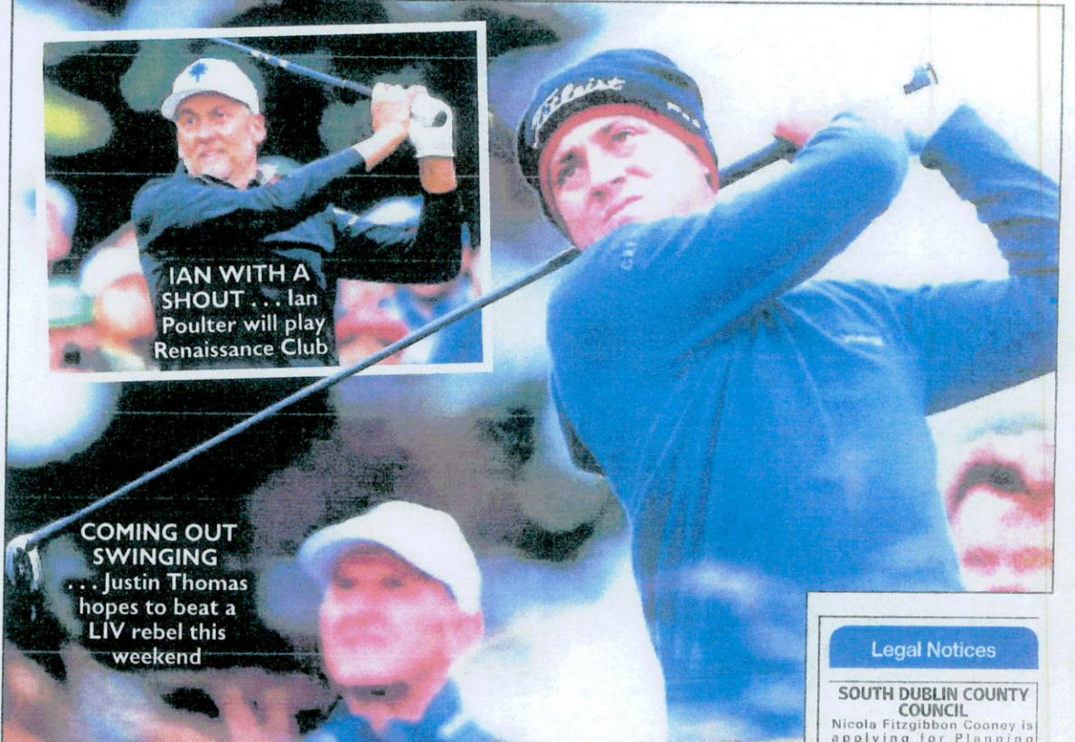
COMING OUT SWINGING... Justin Thomas hopes to beat a LIV rebel this weekend