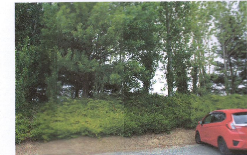
2 - Prunus laurocerasus hedge with buxus sempervirens hedge in front