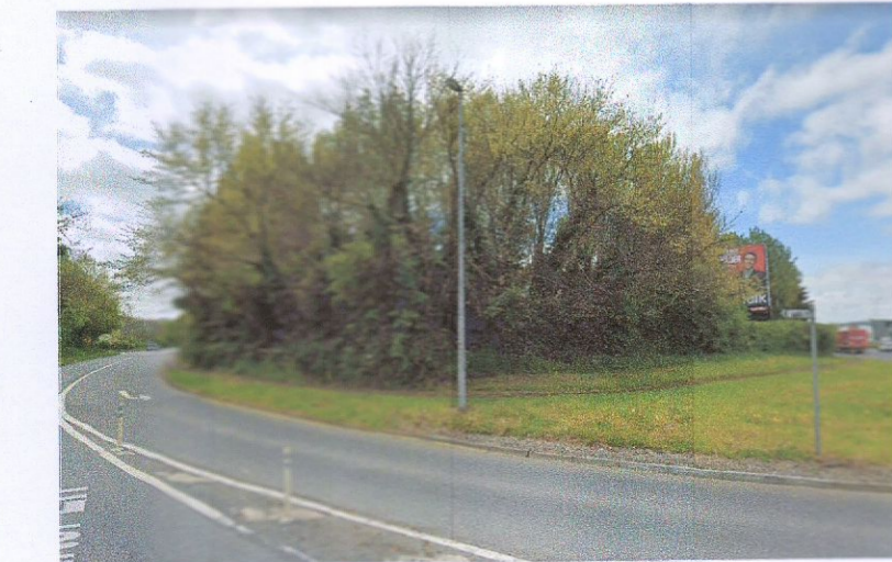
6 - Tree group 2, from Garter lane