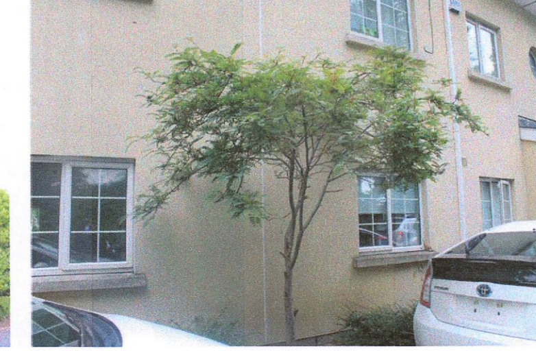
4 - Existing Betula pubescens at the front elevation