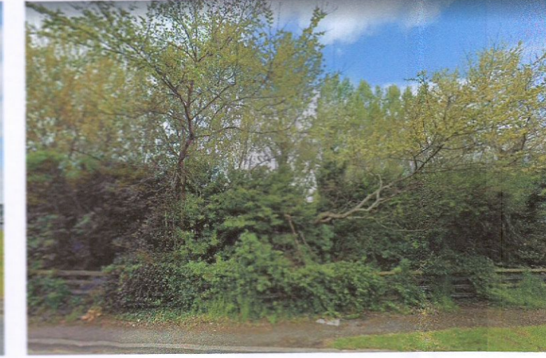
7 - Tree group 1 - Populus nigra / Cupressus Leylandii double hedgerow mix. View from N7 road.