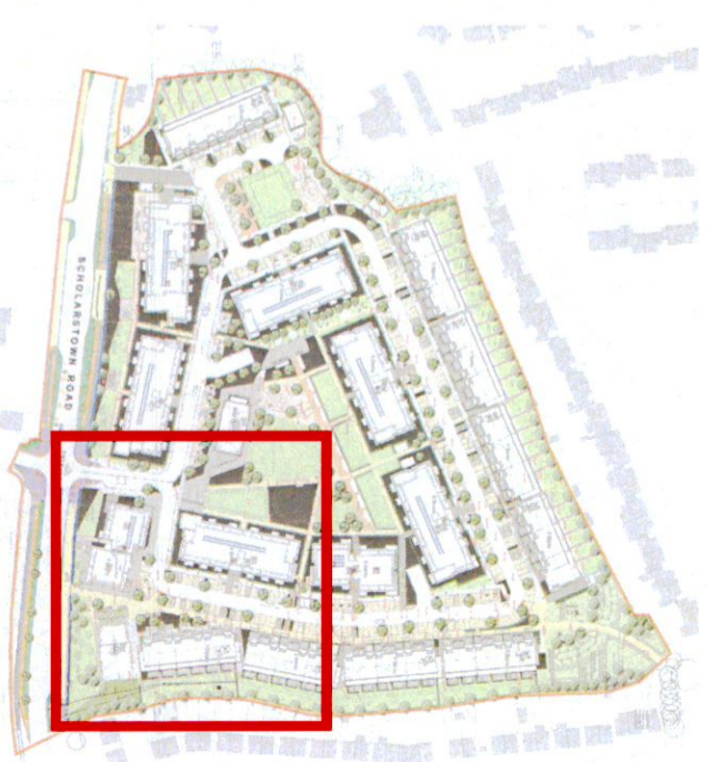
Key Plan Not to Scale