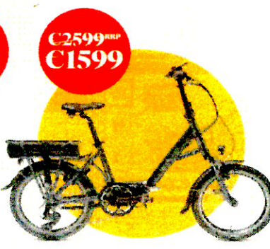
The Veloci Sport