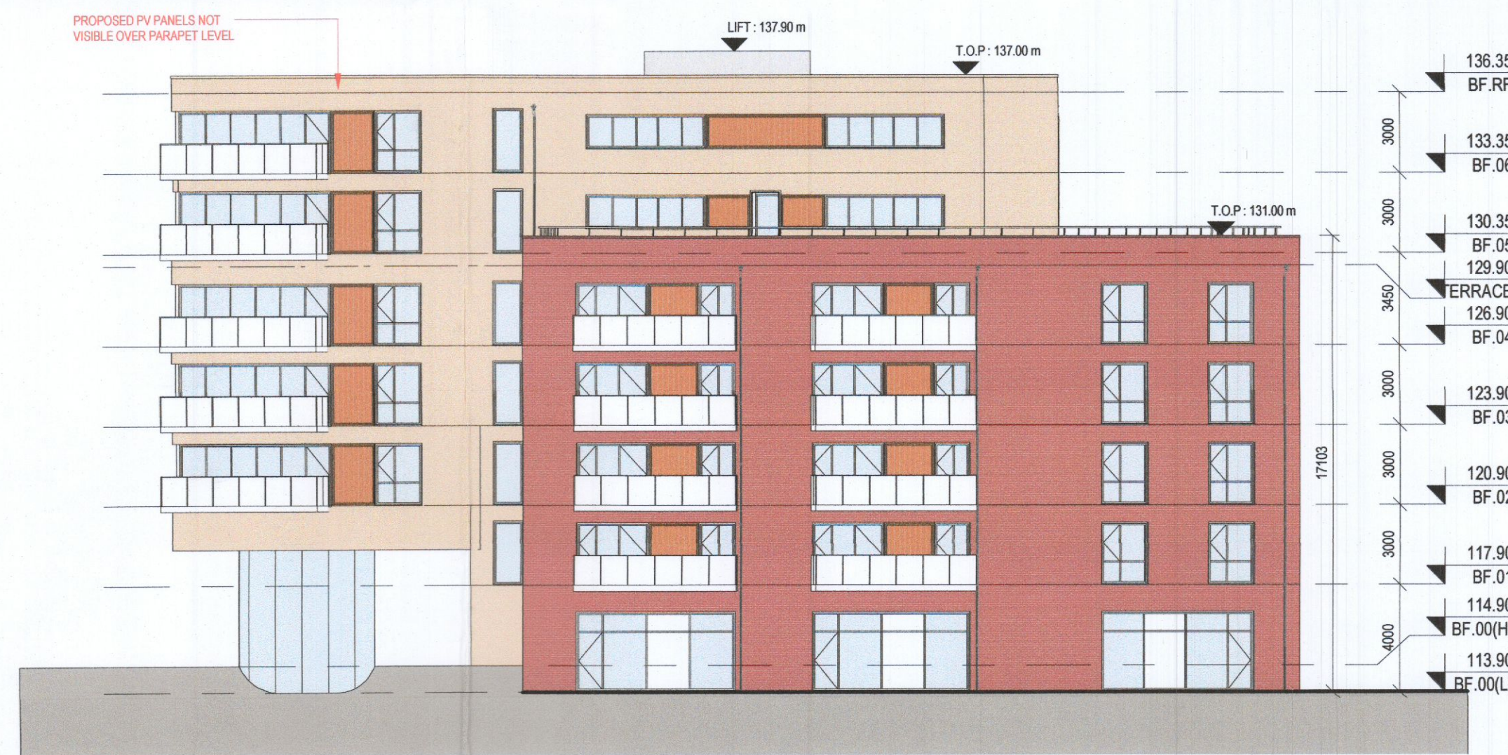
3 PROPOSED - BLOCK F - NORTH ELEVATION Scale: 1 : 200