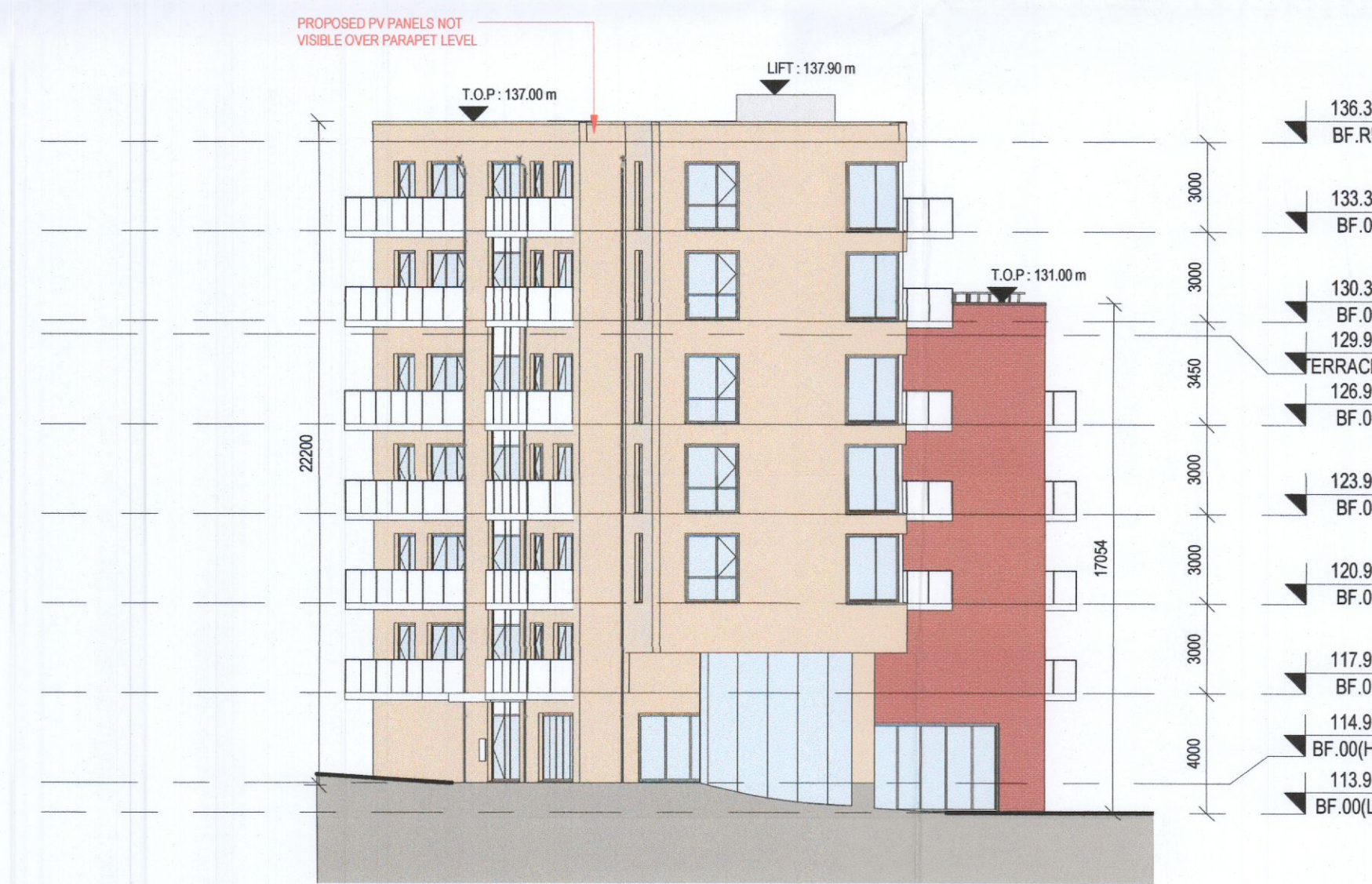
4 PROPOSED - BLOCK F - EAST ELEVATION Scale: 1 : 200