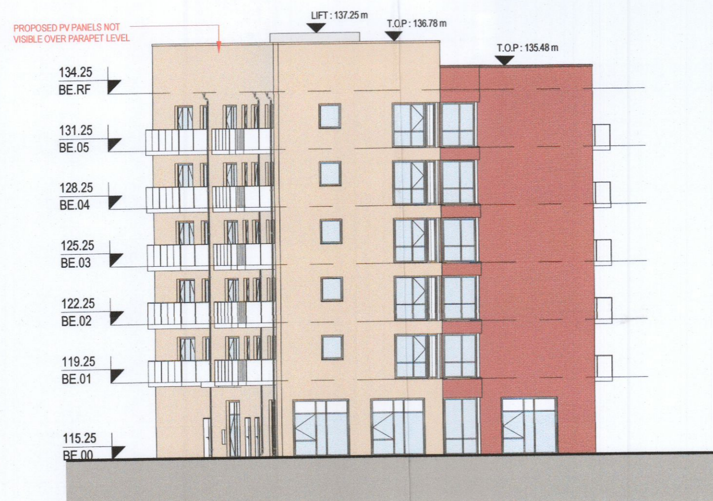
2 PROPOSED - BLOCK E - NORTH ELEVATION Scale: 1 : 200