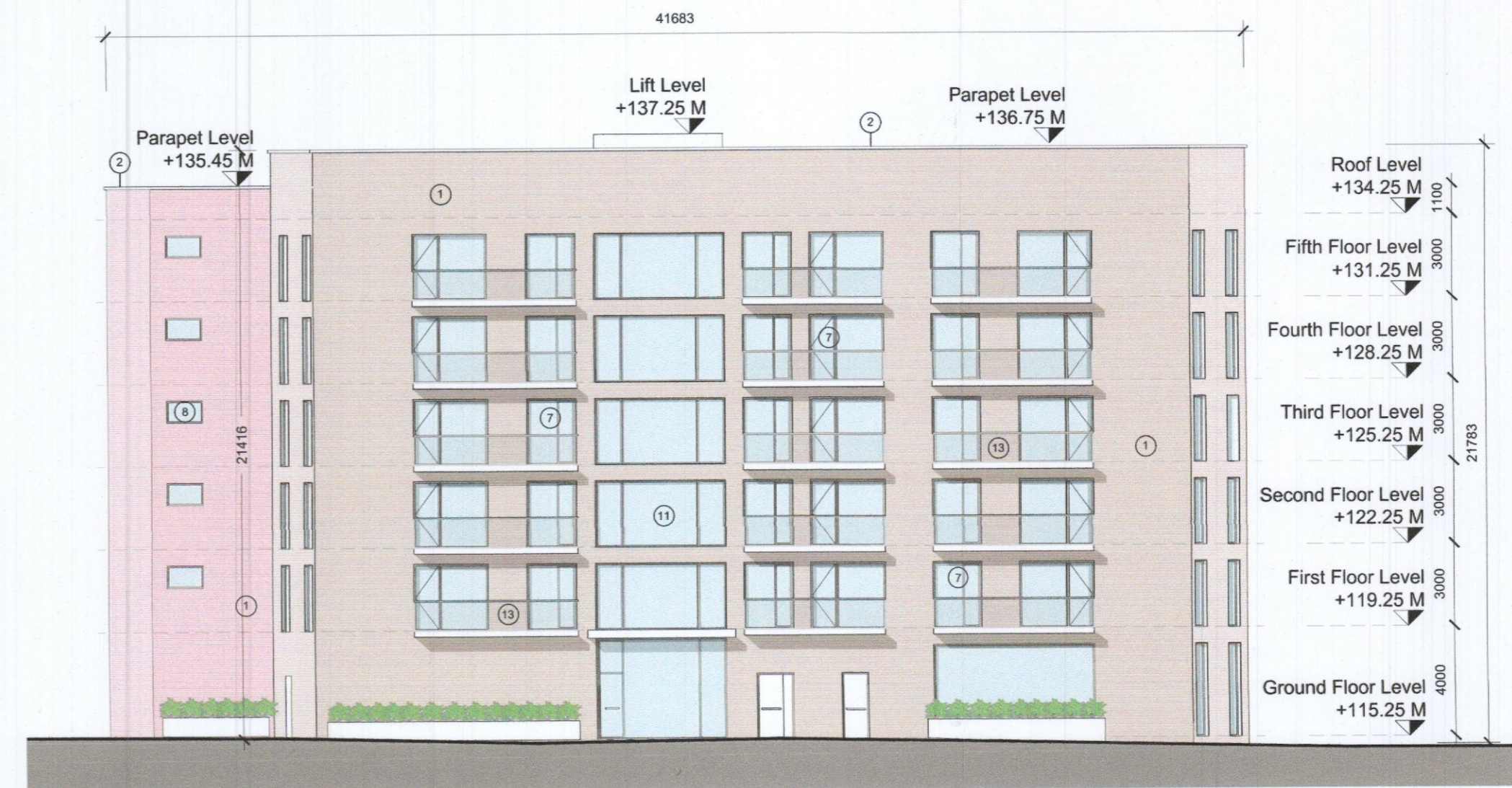
3 EXISTING - BLOCK E - EAST ELEVATION - PLANNING REF ABP-305556-19 Scale: 1 : 200